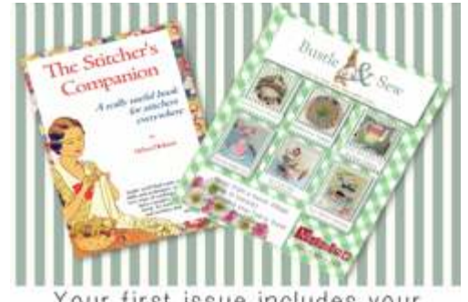
Your first issue includes your free gift "The Stitcher's Companion

PS: If you love stitching then you're sure to enjoy my Bustle & Sew e-zine. It's my own e-zine delivered monthly to your in-box stuffed with ideas, projects, features, articles, patterns and more. Your family and friends will be queuing up to take delivery of your new Bustle & Sew creations.