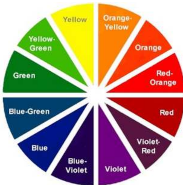
The colour wheel

When setting out on your project, choose a bold and brilliant, or subtle and understated colour scheme, but whichever you decide upon I would recommend that you try to keep it simple and uncluttered. Pare your colour choices down to the minimum as too many colours can look "bitty".