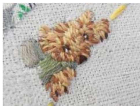
Only three colours for fur ...

When setting out on your project, choose a bold and brilliant, or subtle and understated colour scheme, but whichever you decide upon I would recommend that you try to keep it simple and uncluttered. Pare your colour choices down to the minimum as too many colours can look "bitty".