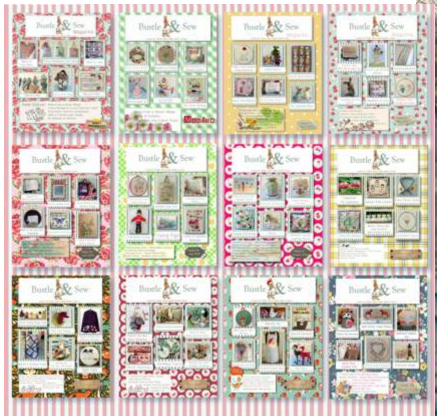
Twelve copies of the Bustle & Sew Magazine