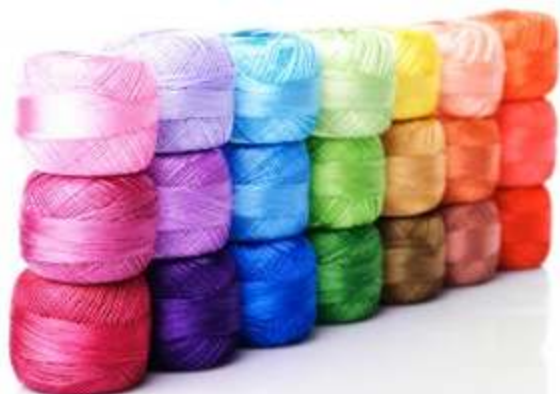
A natural feeling for colour .....

Most people have a natural feeling for colour which we use every day without really thinking about it. When we decide what clothes to wear, paint our walls or even pick and arrange a bunch of flowers we're making colour choices quite naturally without even thinking about it. But somehow when it comes to choosing, or adapting, colours for a piece of stitching it's all too easy to become tense and anxious and lose confidence in our own ability to choose well.