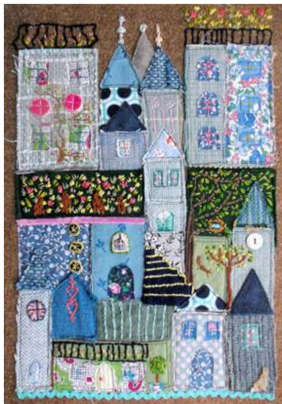
Mainly blues ... with a touch of complementary pink

You can make your colour scheme much more interesting by placing colour-opposites