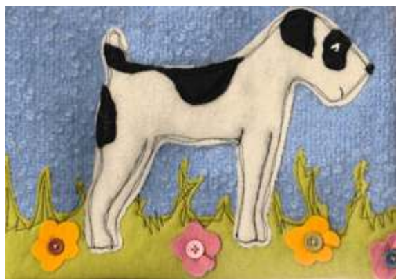
A simple choice of colours

I've found that sometimes it's much easier to collect together a selection of coloured floss or skeins of wool in my hand, just like a bunch of flowers, rather than arranging them in a design. I've discovered that if the colours work well together when collected together this way, then they are more than likely to do so when I work them into my stitching. I add and eliminate extra colours by holding them next to my main choices, keeping them if they seem to add something to the group, but discarding them if they contribute nothing or, worse, detract from those already chosen.