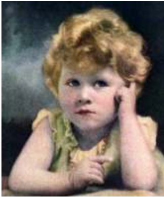
Princess Elizabeth 1929

Our Queen, Elizabeth II is the constitutional monarch of 16 sovereign states (known as the Commonwealth realms) and their territories and dependencies, as well as head of the 54-member Commonwealth of Nations. She is Supreme Governor of the Church of England and, in some of her realms, carries the title of Defender of the Faith as part of her full title.