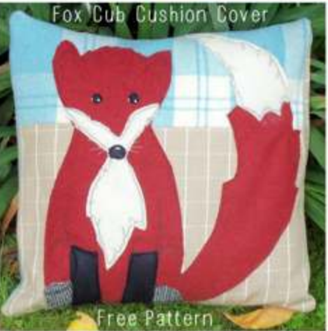
More foxy projects from the Bustle & Sew Magazine...