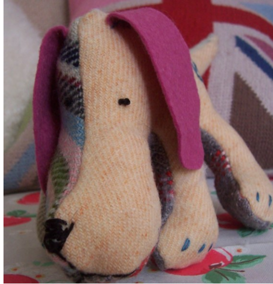
Nose and eyes detail

The pattern above is the original pattern – I didn't cut an eye from felt, but used French knots. Also I only cut two ear pieces from felt and attached to either side of his head with blanket stitch. This version of Humphrey is my copyright and must not be copied for resale, though please feel free to share him with your friends.