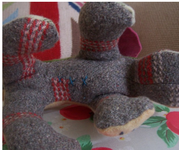
Cross stitch detail on under-gusset (where I turned and stuffed Humphrey).