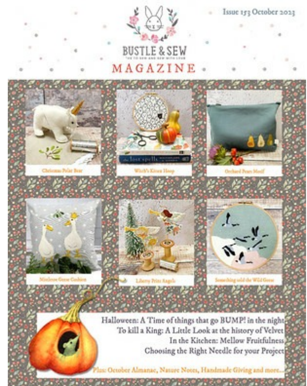
Issue 153 October 2023