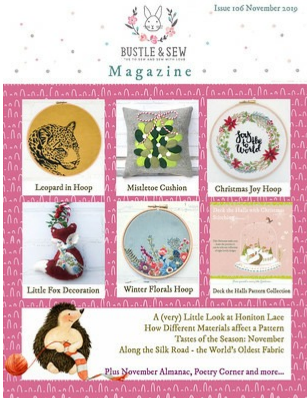
Issue 106 November 2019