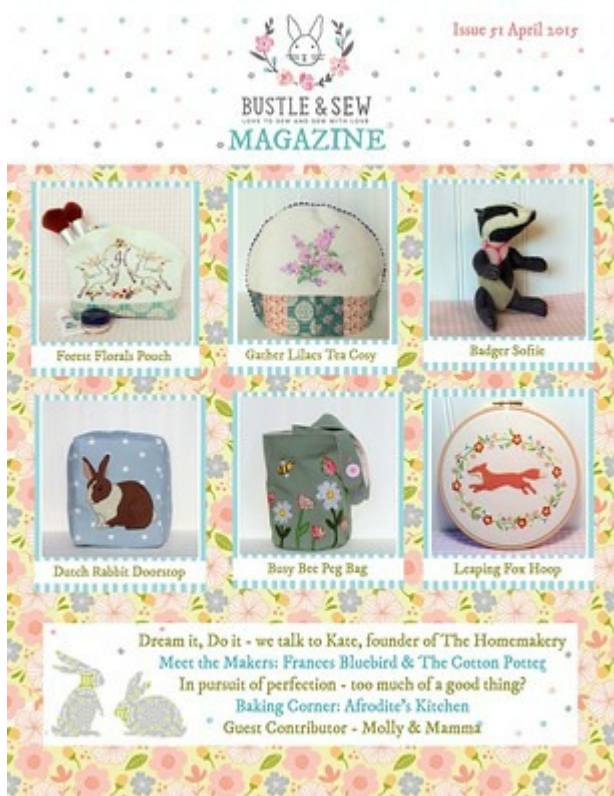
Issue 51 April 2015