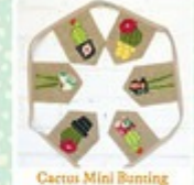
Cactus Mini Bunting