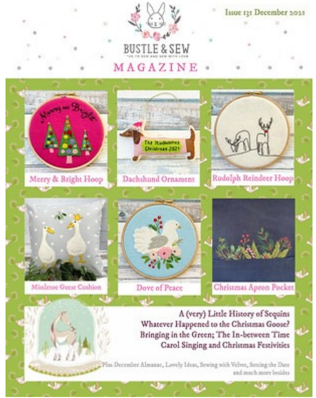
Issue 131 December 2021