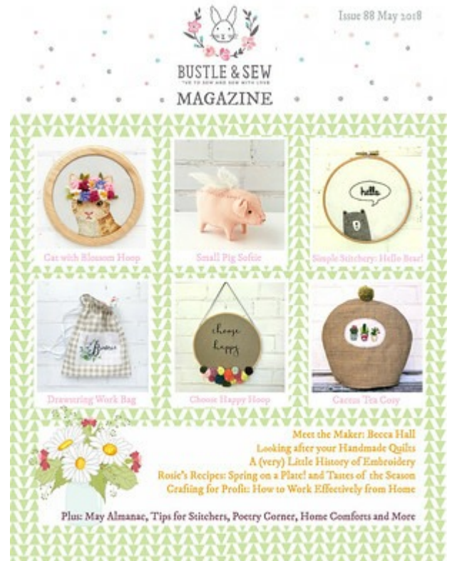
Issue 88 May 2018