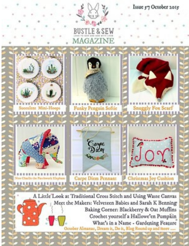
Issue 57 October 2015