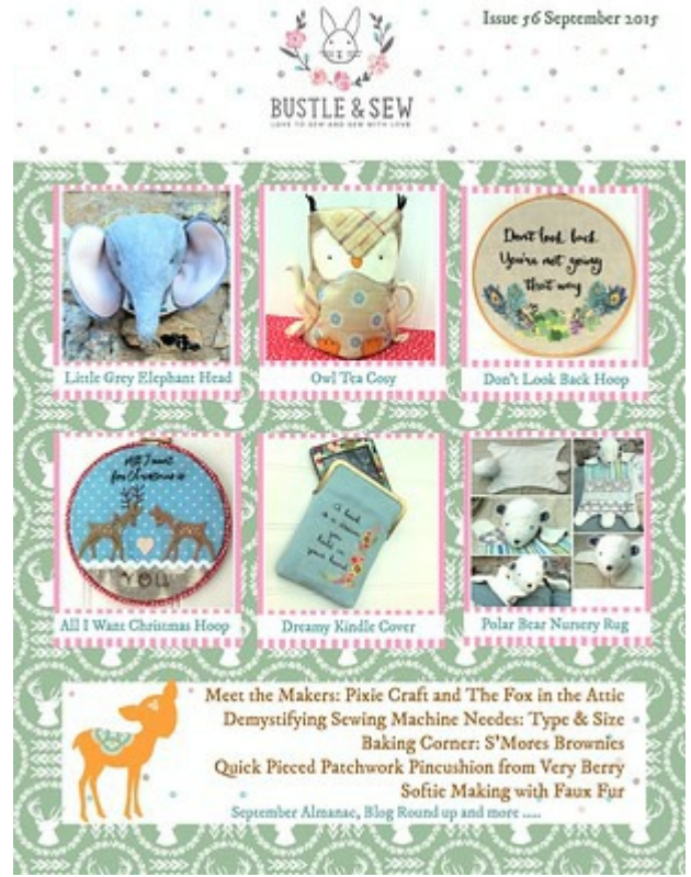
Issue 56 September 2015