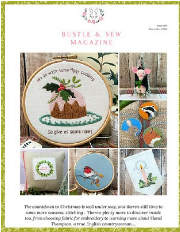
Issue 166 November 2024