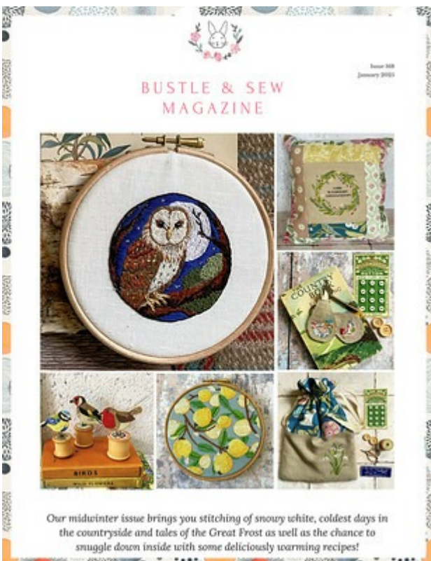
Issue 168 January 2025