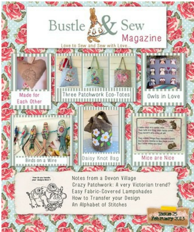
Issue 25 February 2013