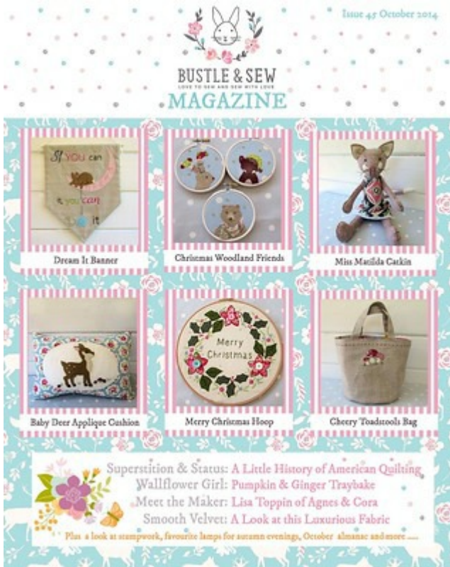
Issue 45 October 2014