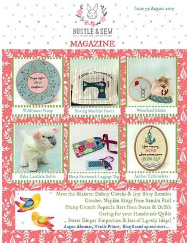
Issue 55 August 2015