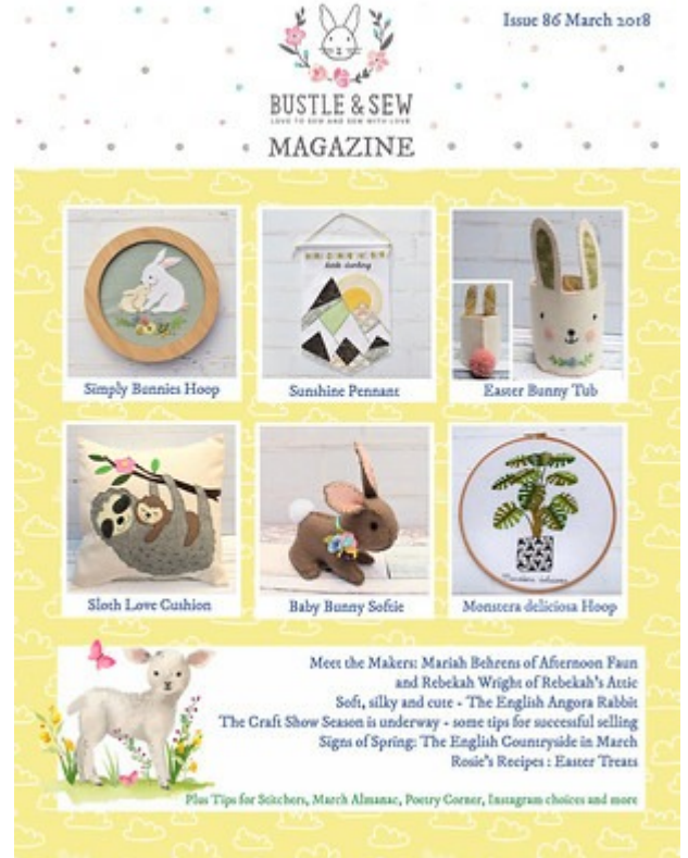
Issue 86 March 2018