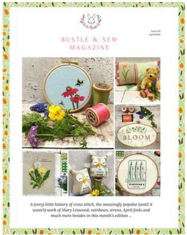
Issue 159 April 2024