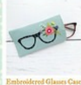
Embroidered Glasses Case