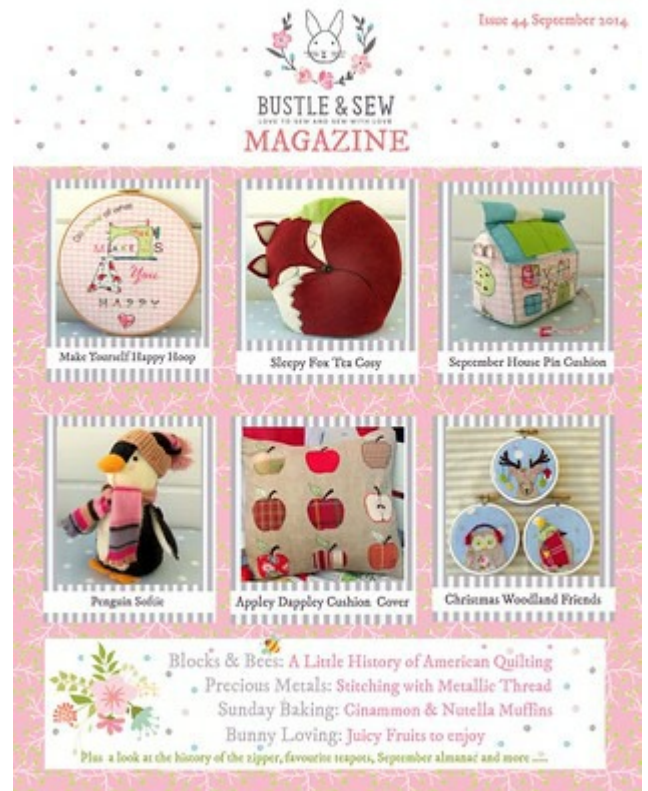
Issue 44 September 2014