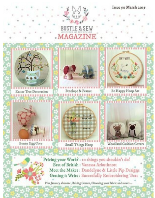
Issue 50 March 2015