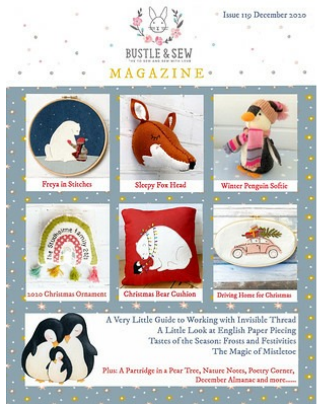
Issue 119 December 2020