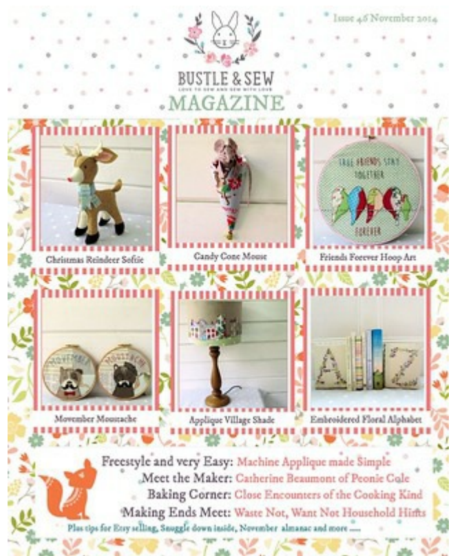
Issue 46 November 2014