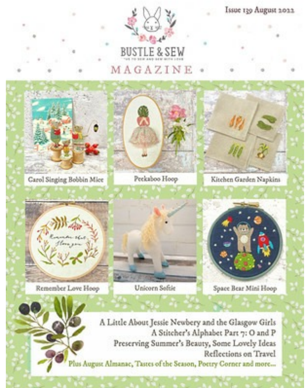
Issue 139 August 2022