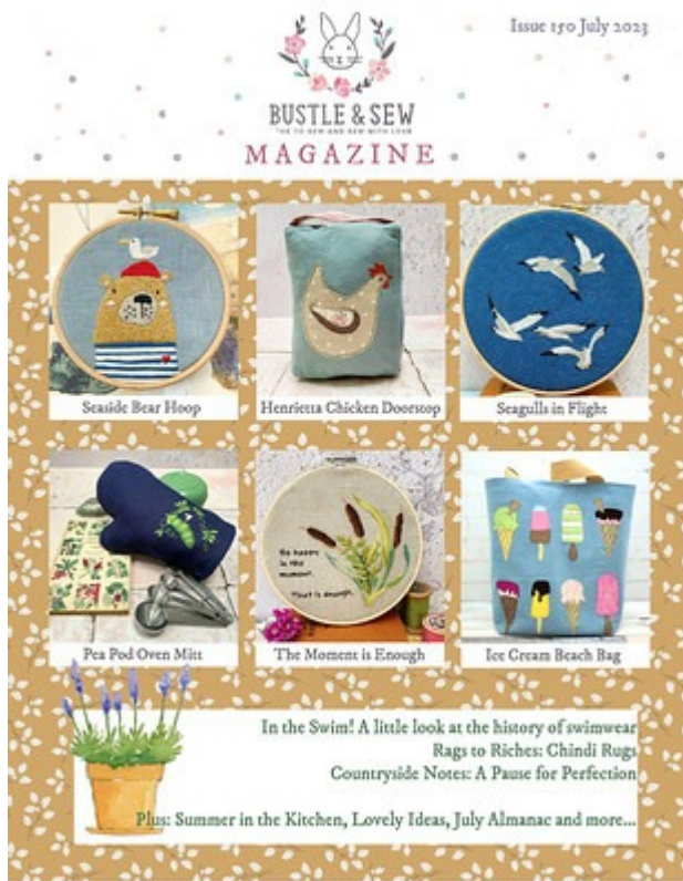
Issue 150 July 2023