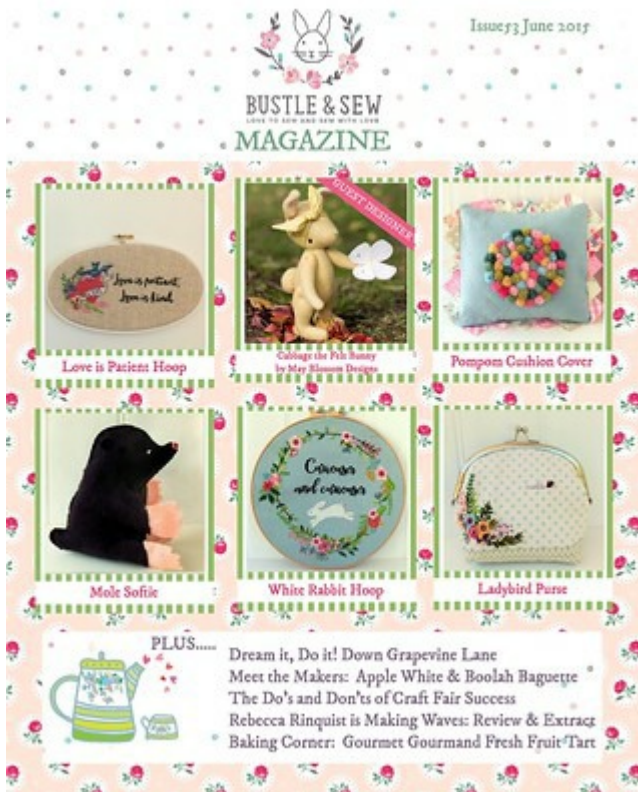
Issue 53 June 2015