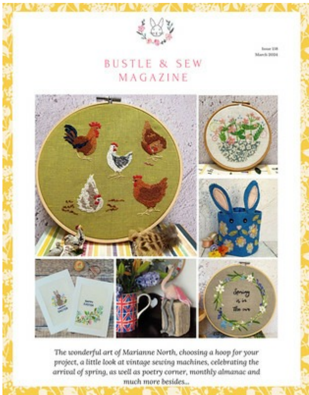
Issue 158 March 2024