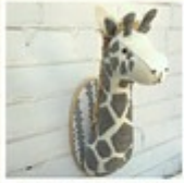
Giraffe Trophy Head

BUSTLE & SEW THE TO DO AND SEE WITH LOVE MAGAZINE