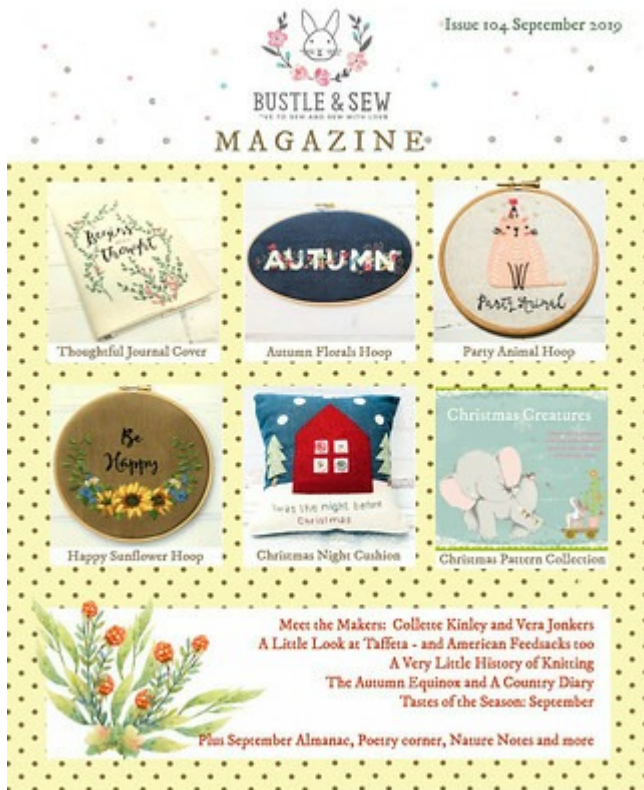
Issue 104 September 2019