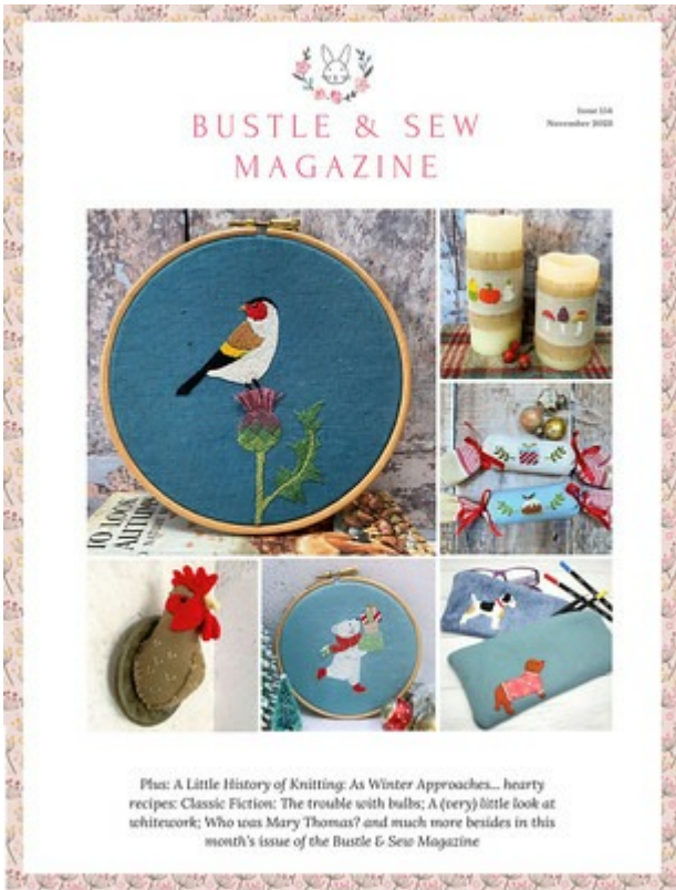
Issue 154 November 2023