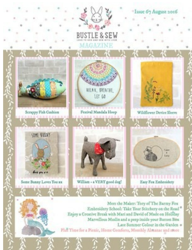
Issue 67 August 2016