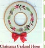
Christmas Garland Hoop