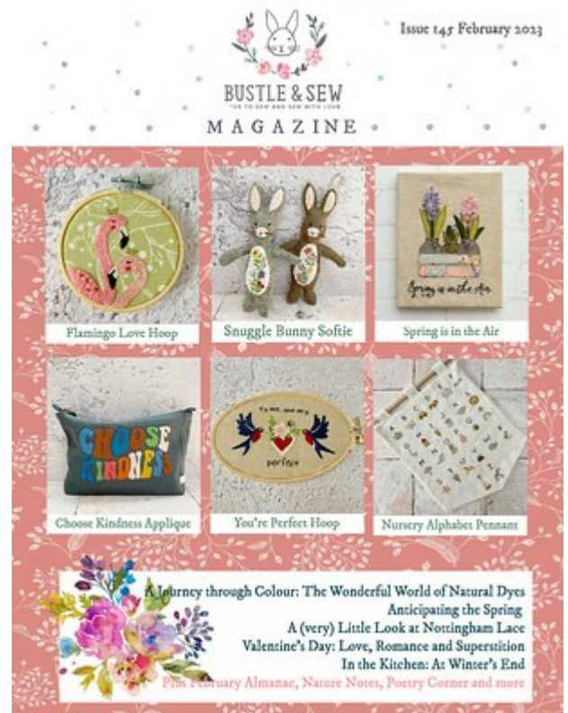
Issue 145 February 2023