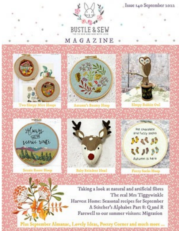
Issue 140 September 2022