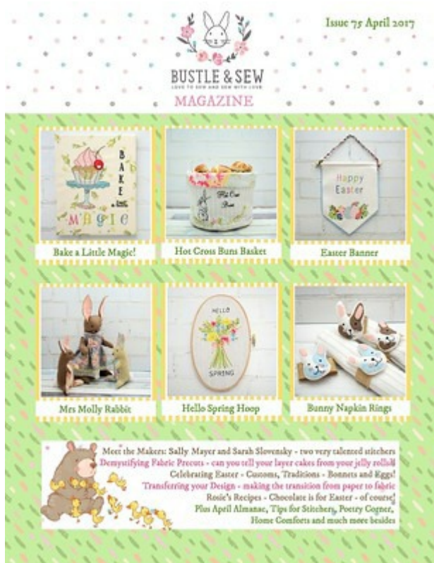
Issue 75 April 2017