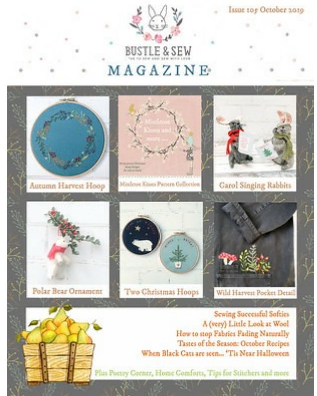
Issue 105 October 2019