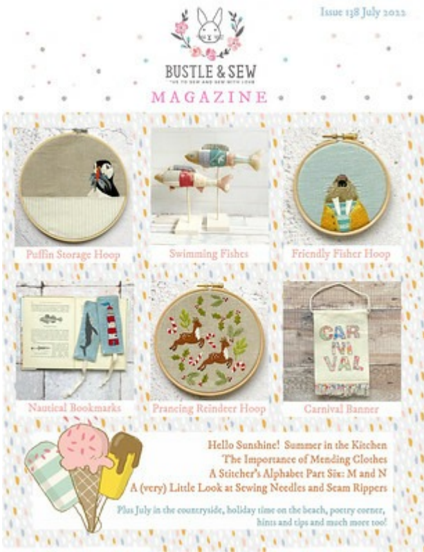
Issue 138 July 2022