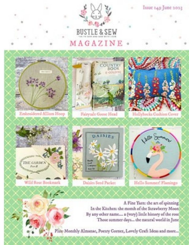
Issue 149 June 2023