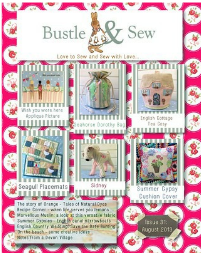
Issue 31 August 2013