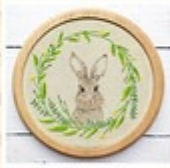
Baby Rabbit Hoop