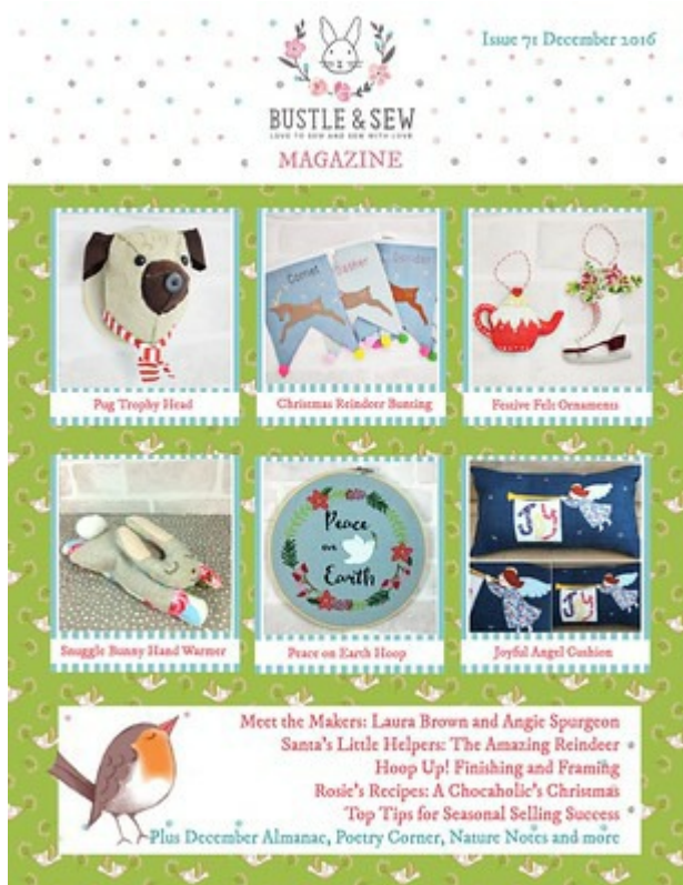
Issue 71 December 2016