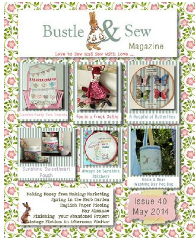
Issue 40 May 2014