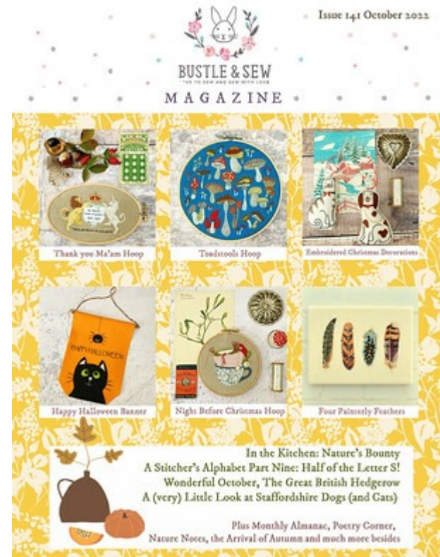
Issue 141 October 2022