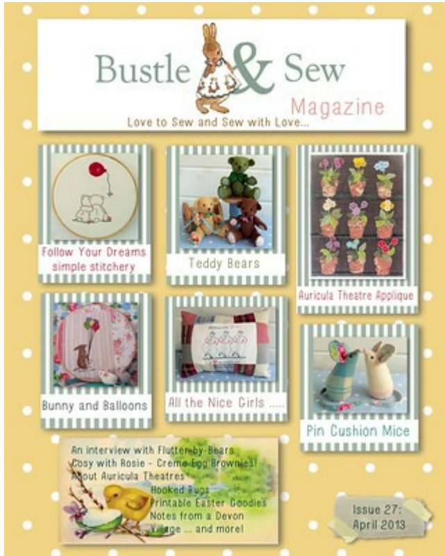
Issue 27 April 2013