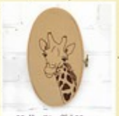
Hello Giraffe Hoop