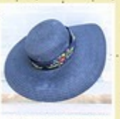
Embroidered Hat Band