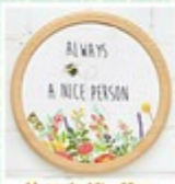
Always be Nice Hoop