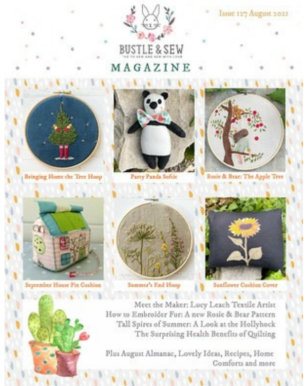
Issue 127 August 2021