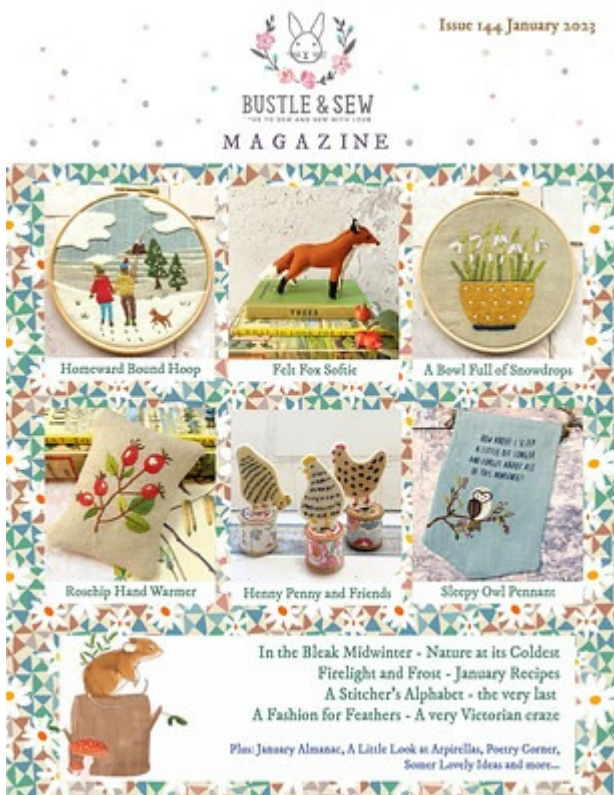
Issue 144 January 2023