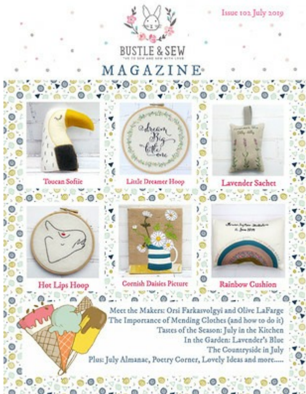
Issue 102 July 2019