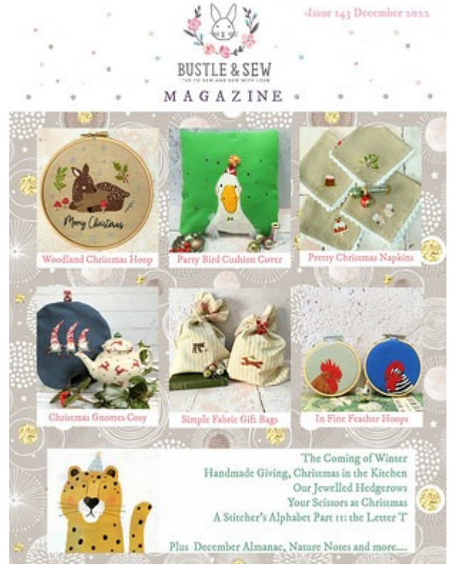
Issue 143 December 2022