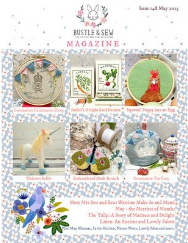
Issue 148 May 2023