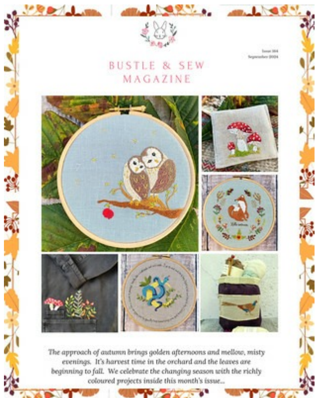
Issue 164 September 2024