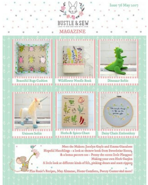
Issue 76 May 2017