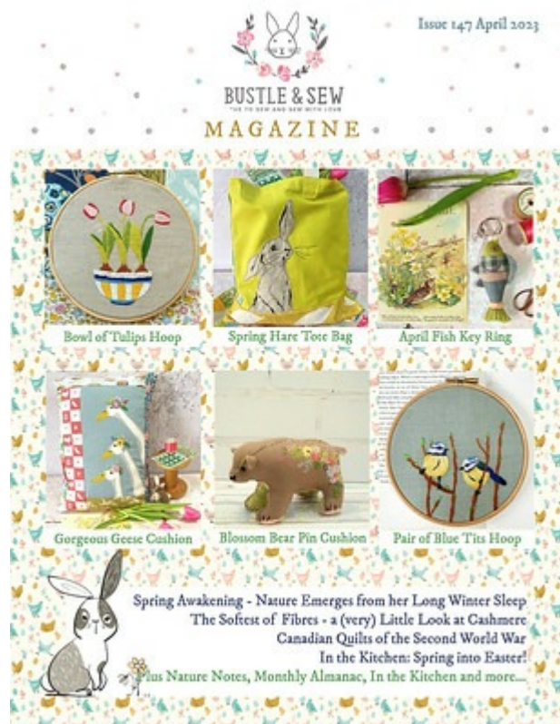
Issue 147 April 2023