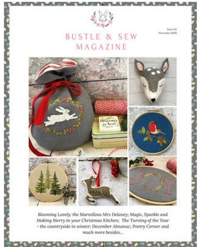
Issue 155 December 2023