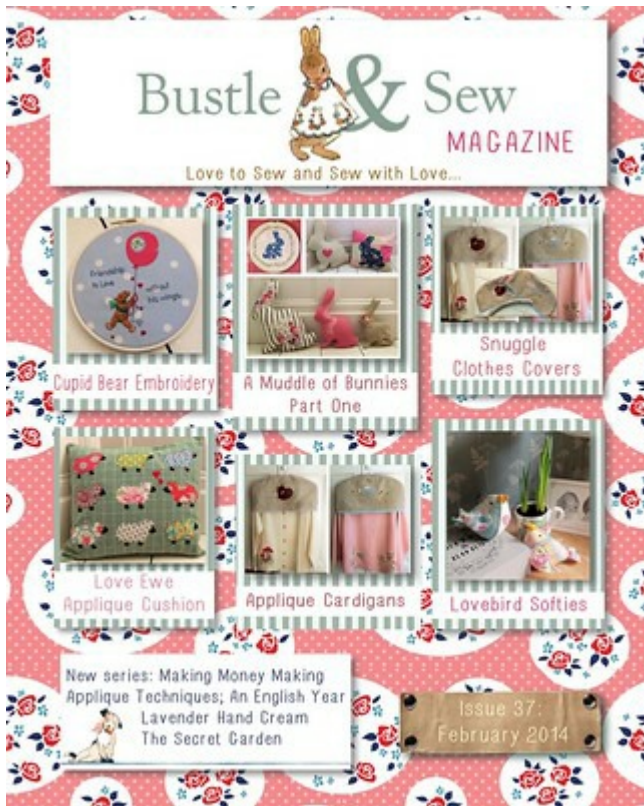
Issue 37 February 2014