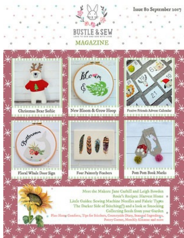
Issue 80 September 2017