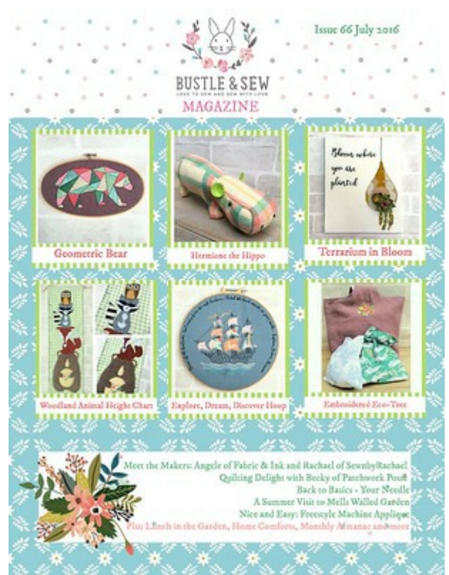
Issue 66 July 2016