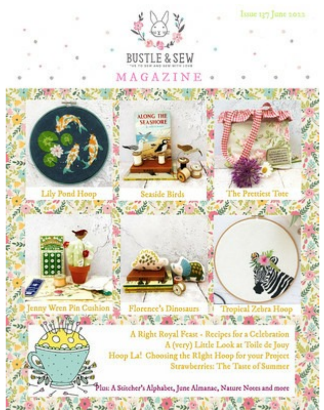
Issue 137 June 2022