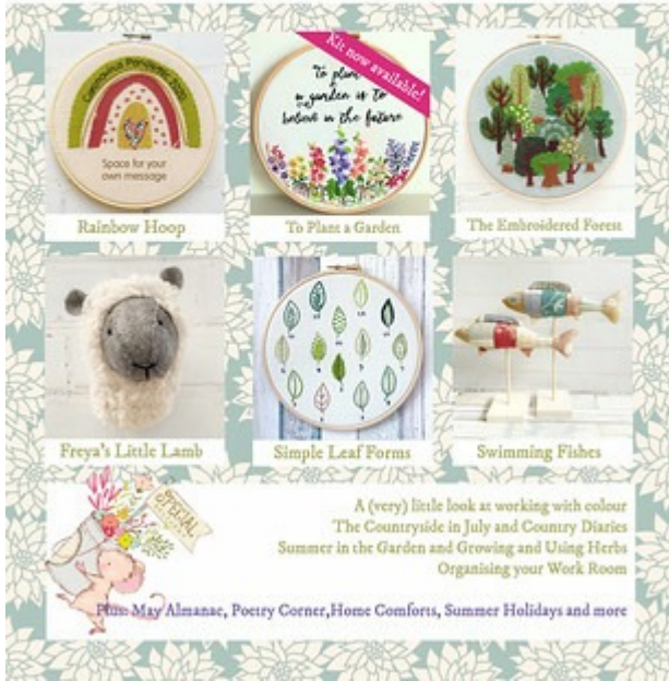
Issue 114 July 2020