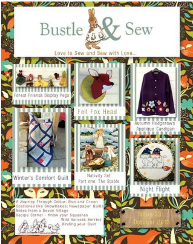
Issue 33 October 2013