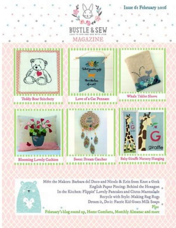
Issue 61 February 2016