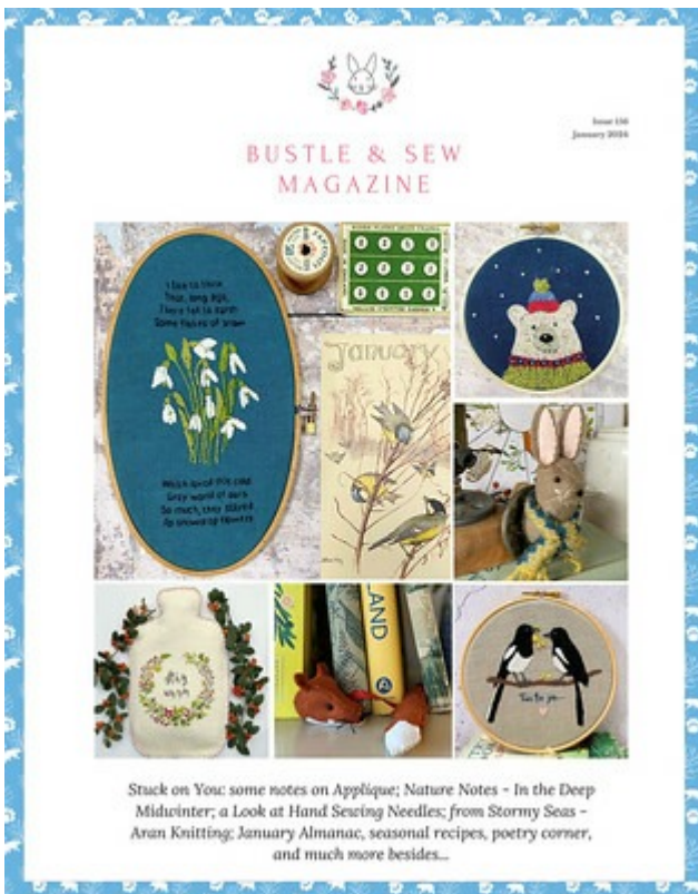
Issue 156 January 2024