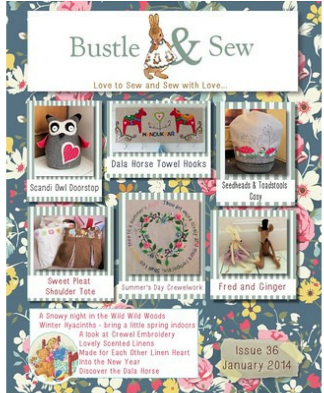
Issue 36 January 2014