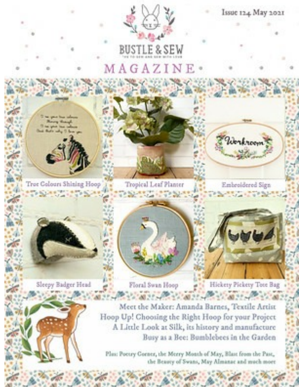
Issue 124 May 2021