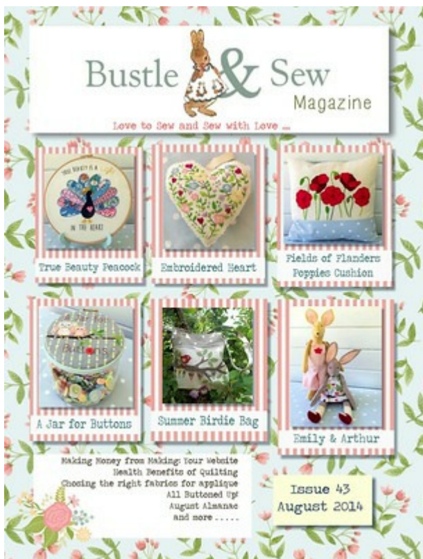
Issue 43 August 2014