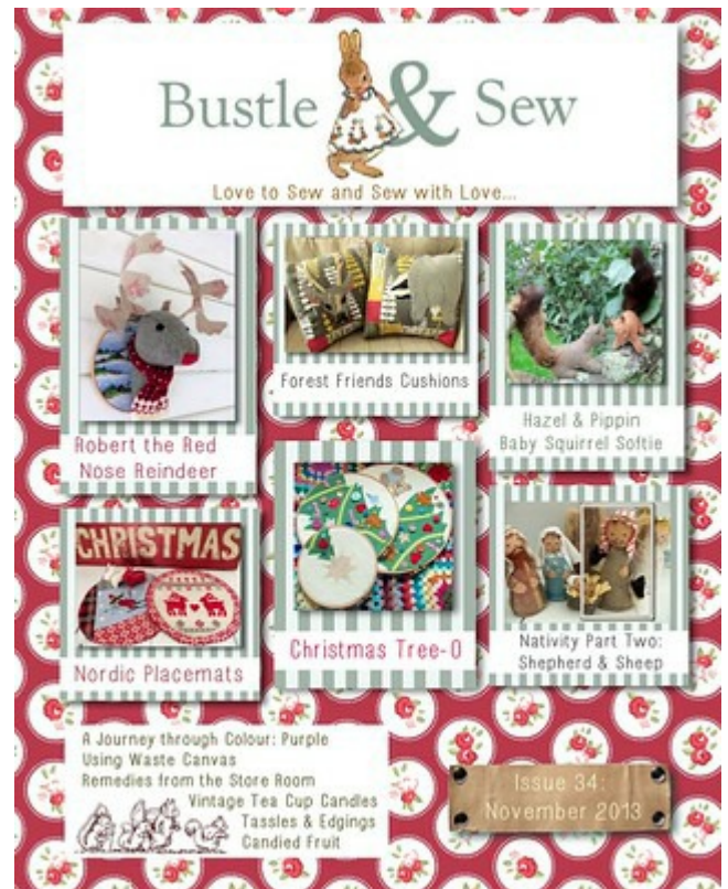
Issue 34 November 2013