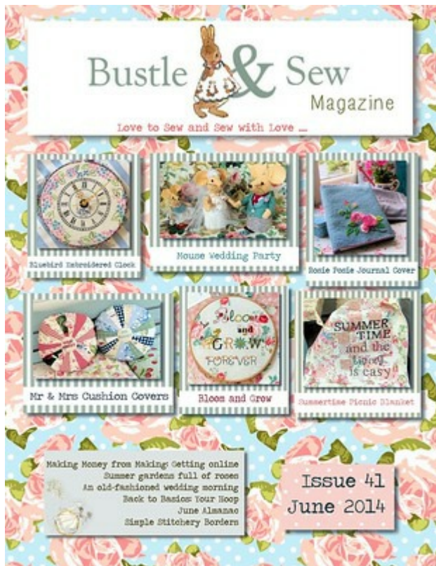
Issue 41 June 2014