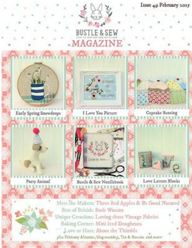
Issue 49 February 2015