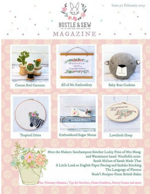
Issue 97 February 2019