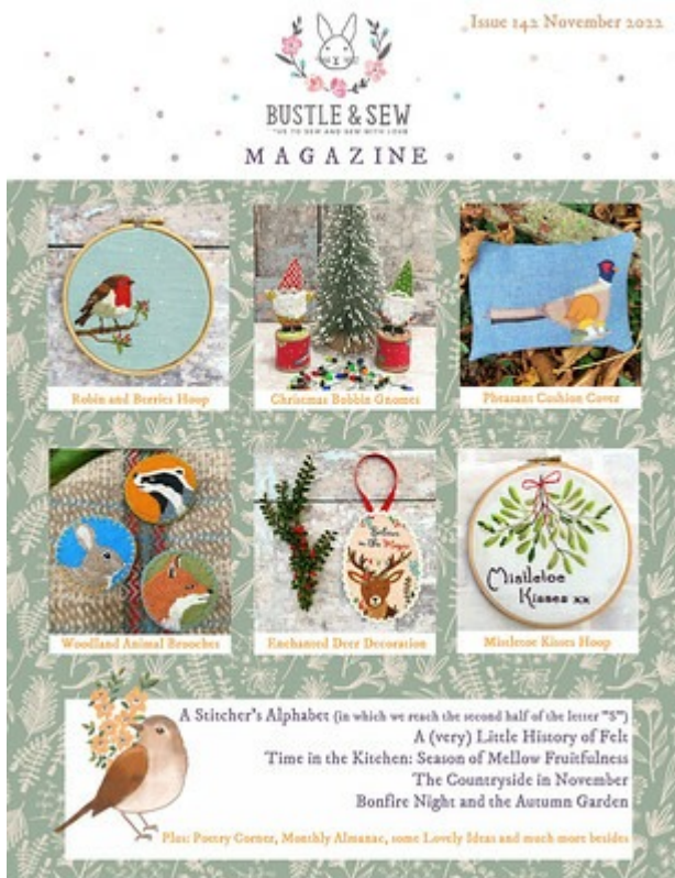
Issue 142 November 2022