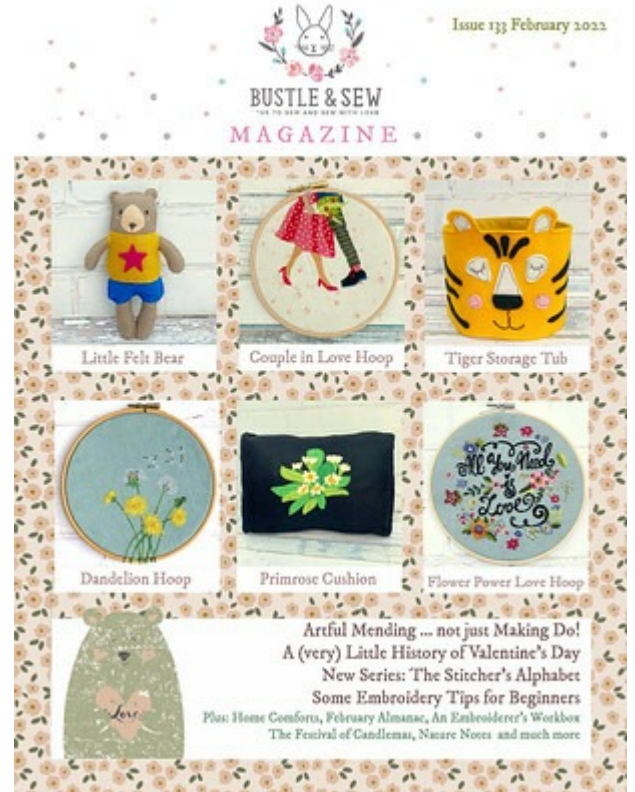
Issue 133 February 2022