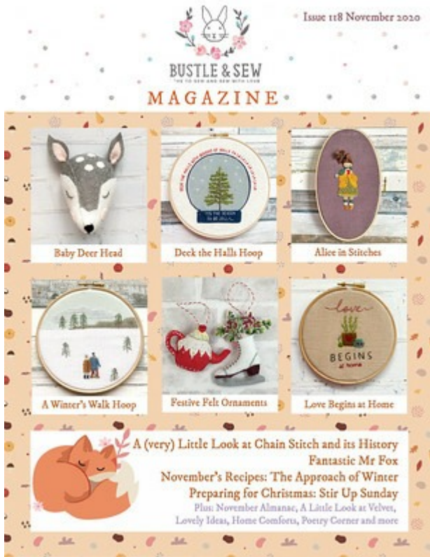
Issue 118 November 2020