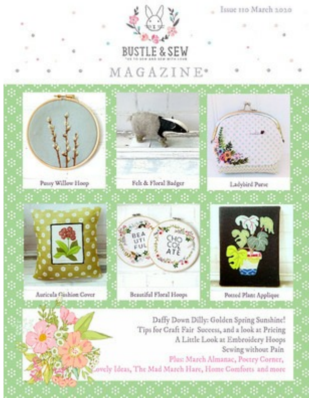
Issue 110 March 2020