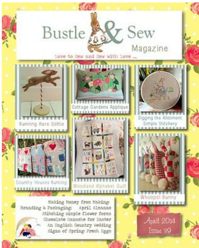
Issue 39 April 2014