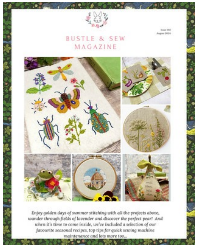
Issue 163 August 2024