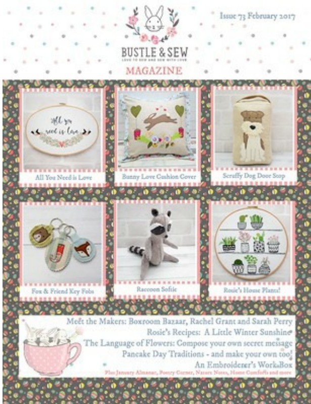
Issue 73 February 2017