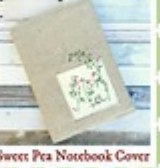
Sweet Pea Notebook Cover