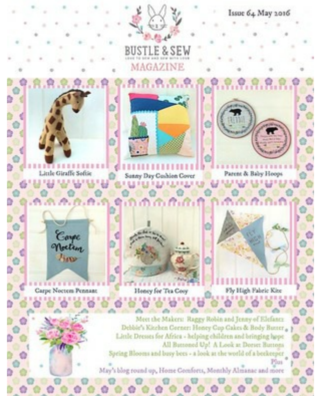
Issue 64 May 2016