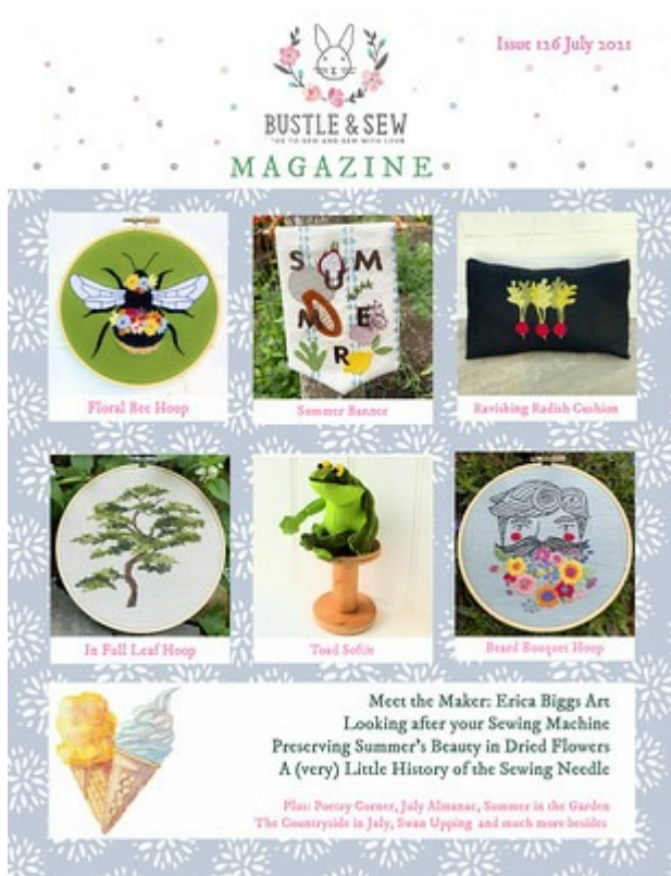
Issue 126 July 2021