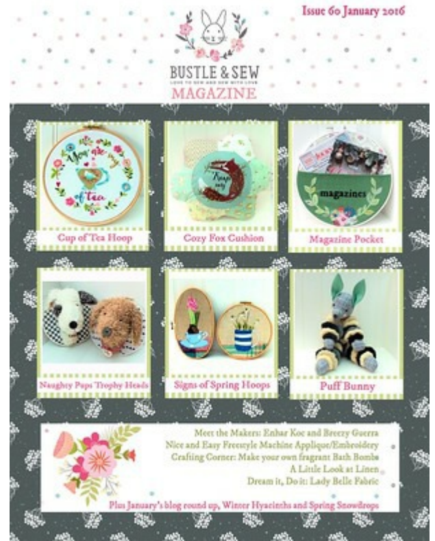
Issue 60 January 2016