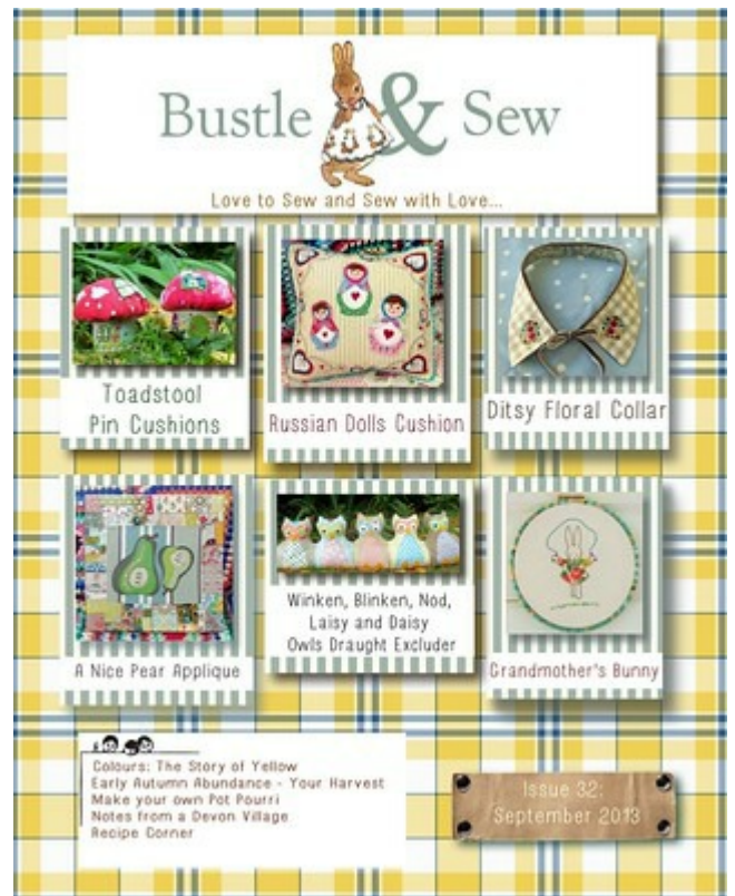
Issue 32 September 2013