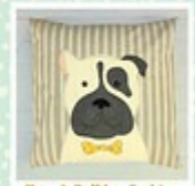
French Bulldog Cushion