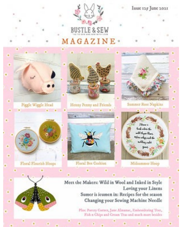
Issue 125 June 2021