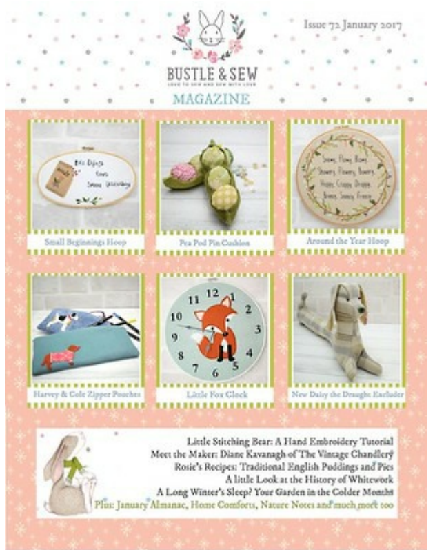
Issue 72 January 2017