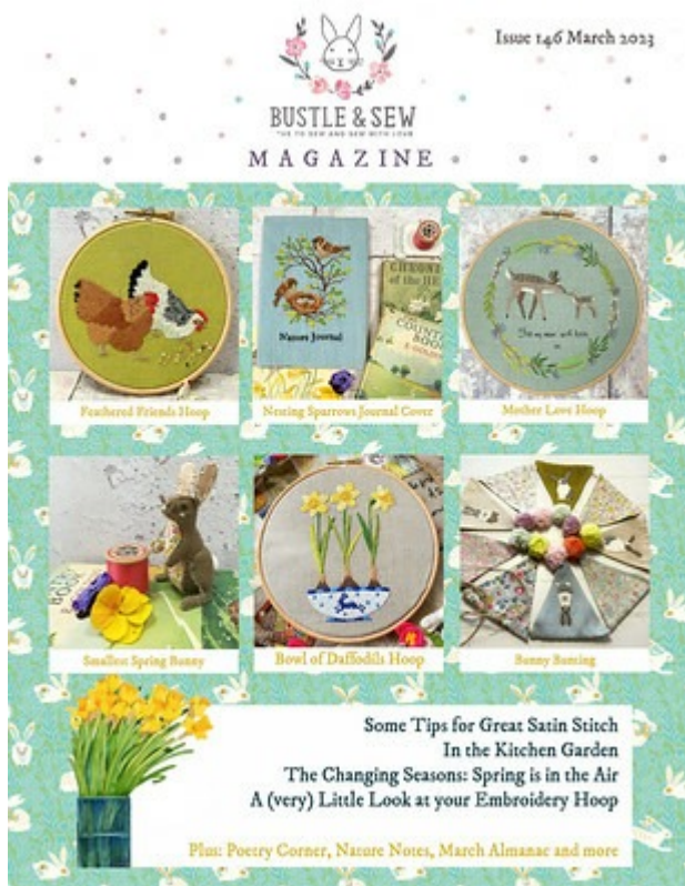
Issue 146 March 2023