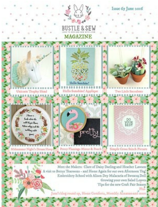
Issue 65 June 2016