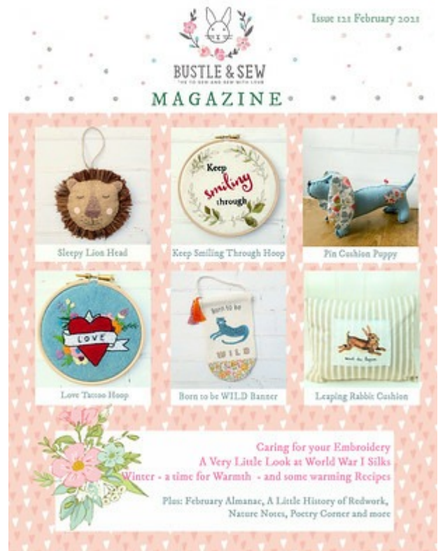
Issue 121 February 2021