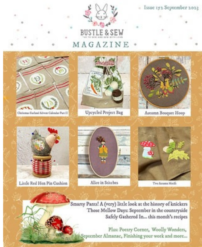
Issue 152 September 2023