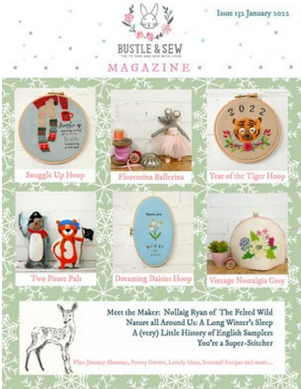
Issue 132 January 2022