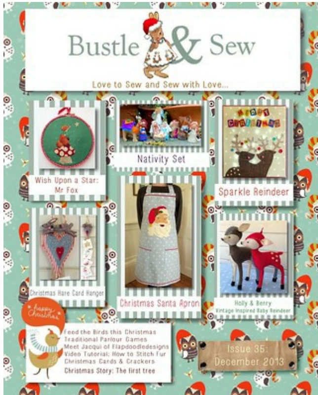
Issue 35 December 2013