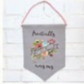
Practically Perfect Pennant