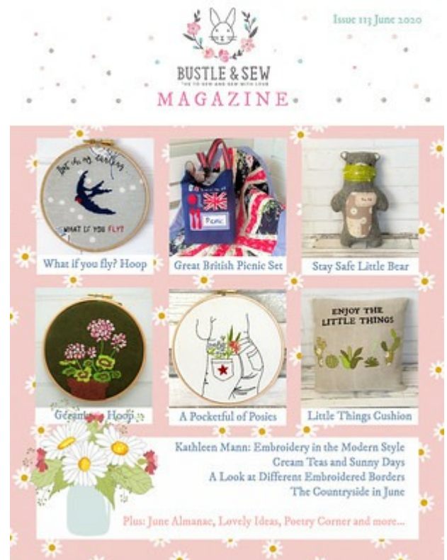
Issue 113 June 2020