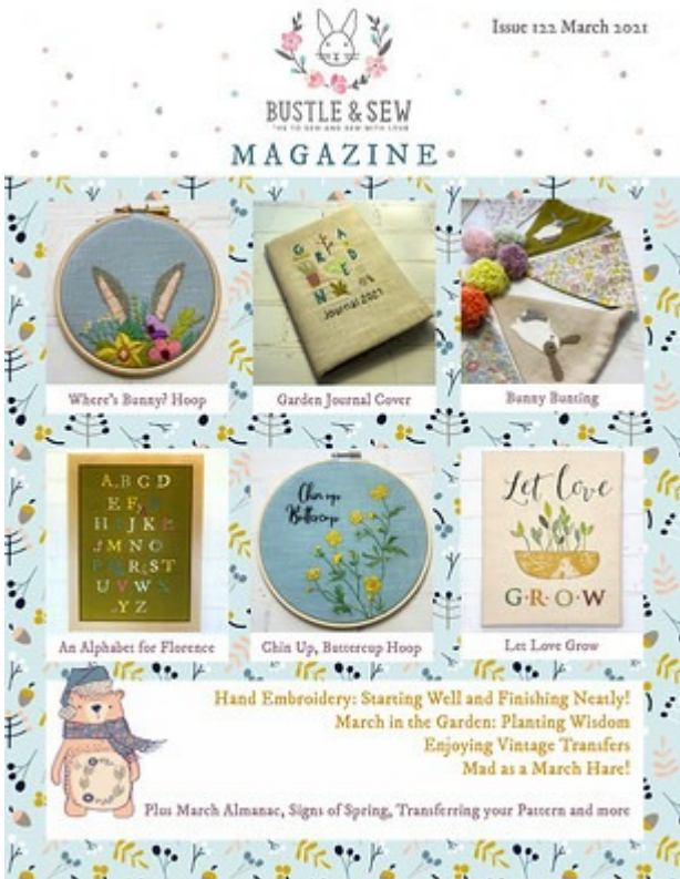
Issue 122 March 2021