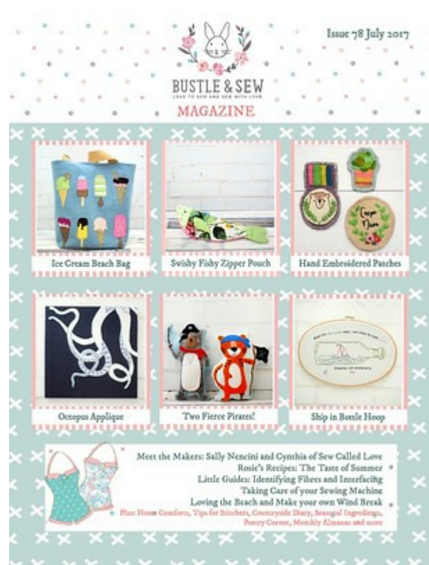
Issue 78 July 2017