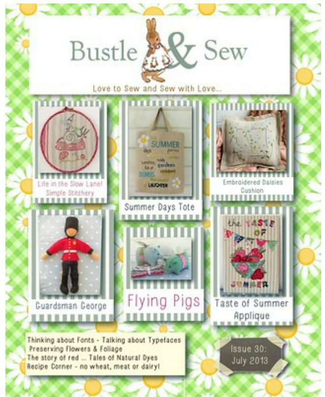
Issue 30 July 2013