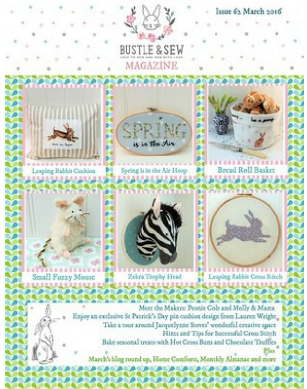
Issue 62 March 2016