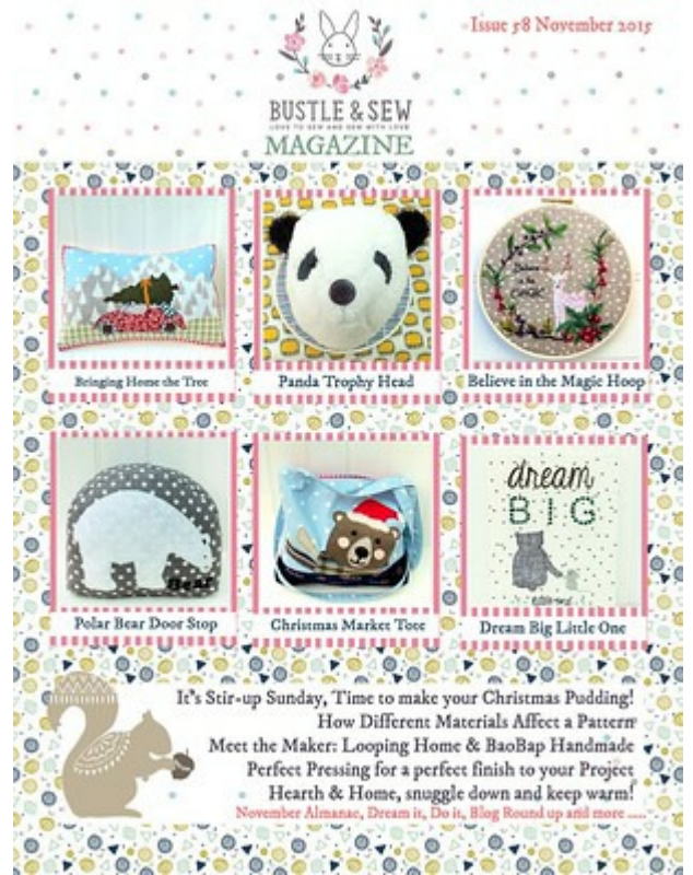
Issue 58 November 2015