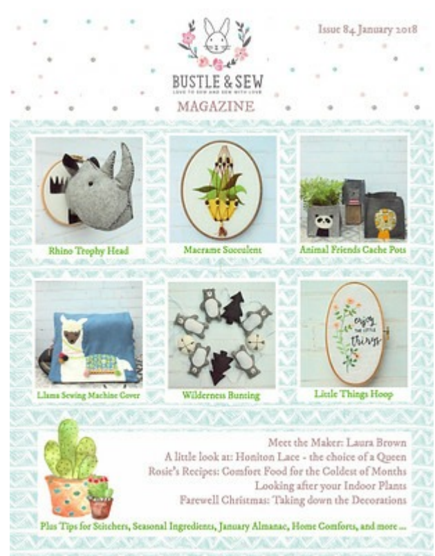
Issue 84 January 2018