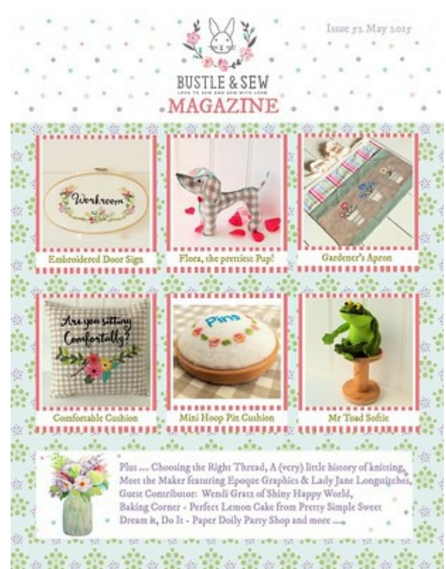
Issue 52 May 2015