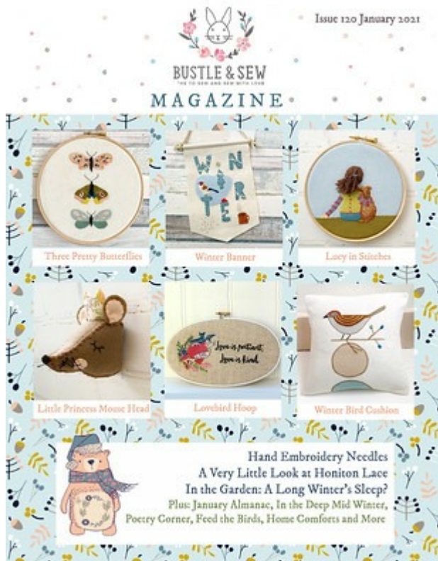
Issue 120 January 2021