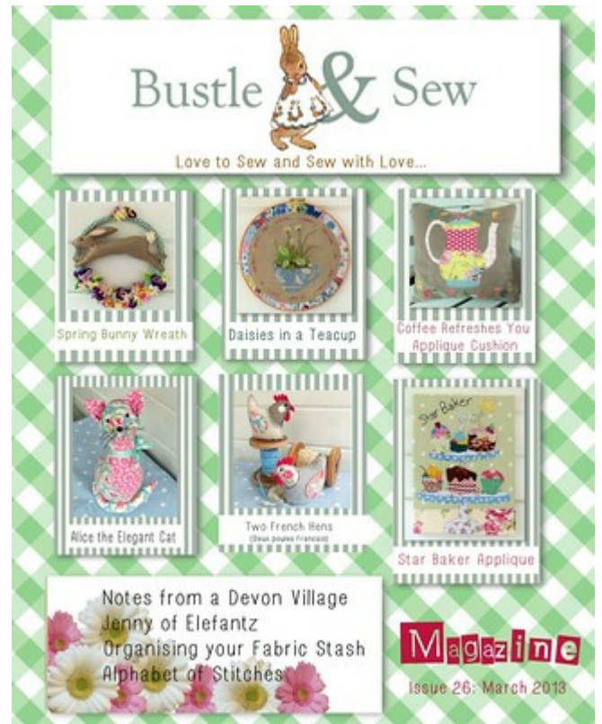
Issue 26 March 2013