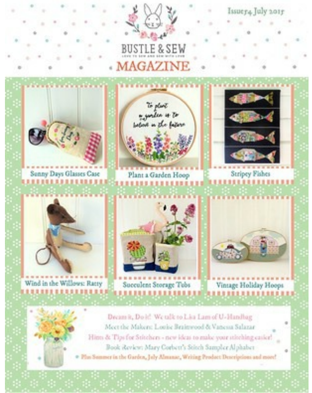
Issue 54 July 2015