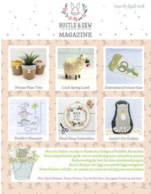
Issue 87 April 2018