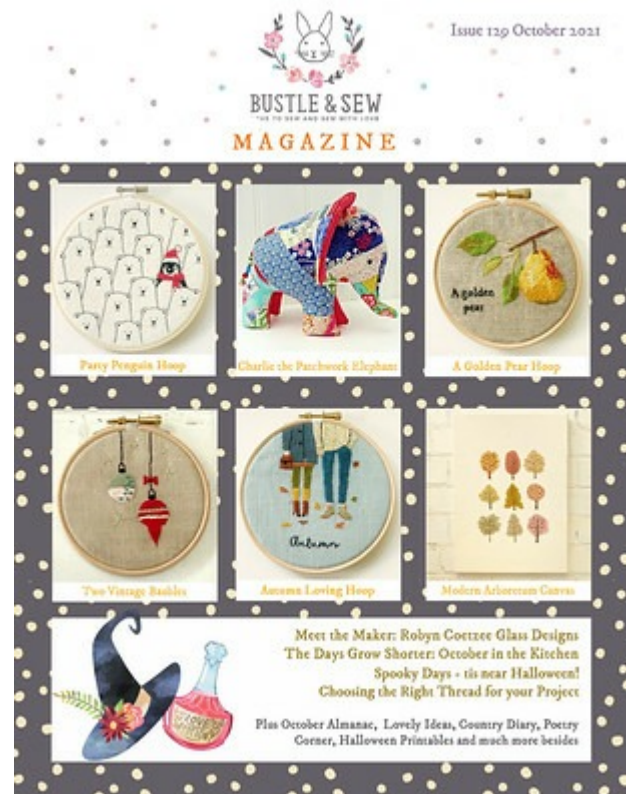
Issue 129 October 2021