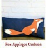
Fox Applique Cushion