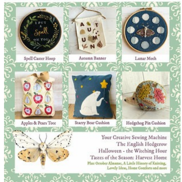
Issue 117 October 2020