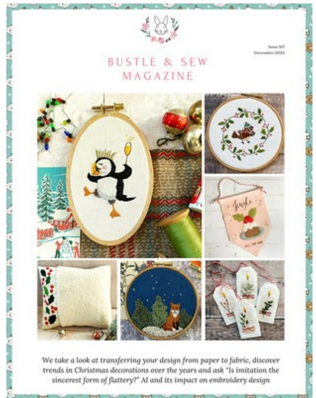
Issue 167 December 2024