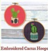
Embroidered Cactus Hoops