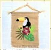
Tropical Toucan Hanging