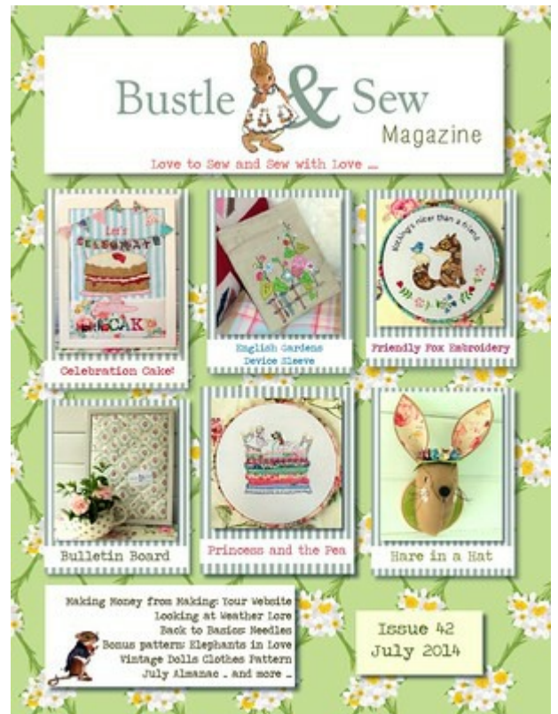
Issue 42 July 2014