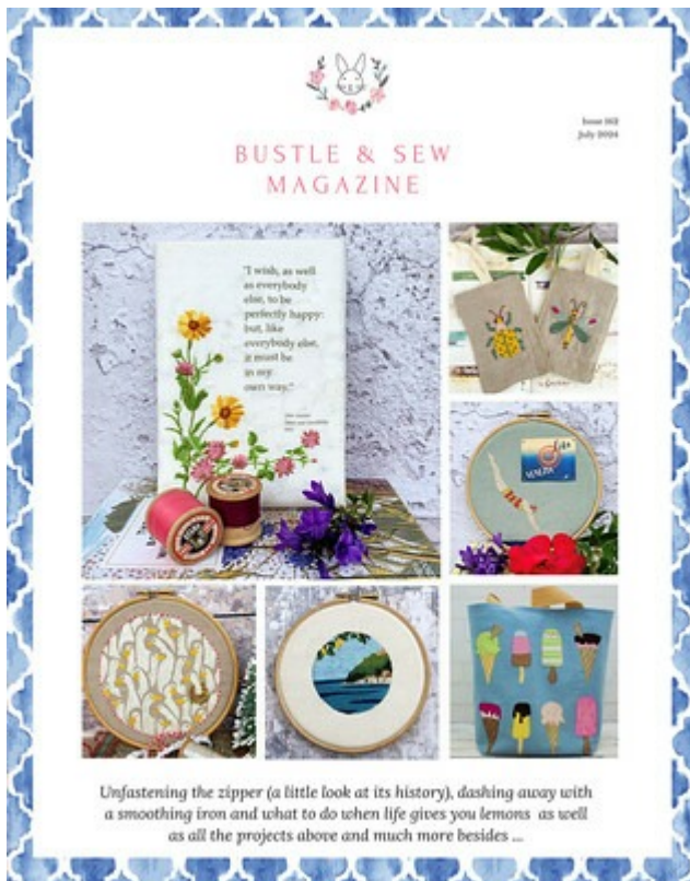
Issue 162 July 2024