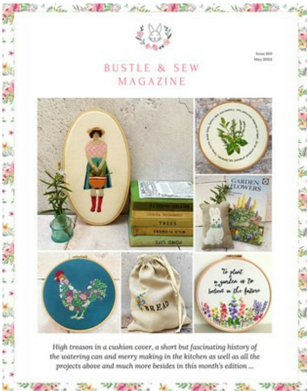
Issue 160 May 2024