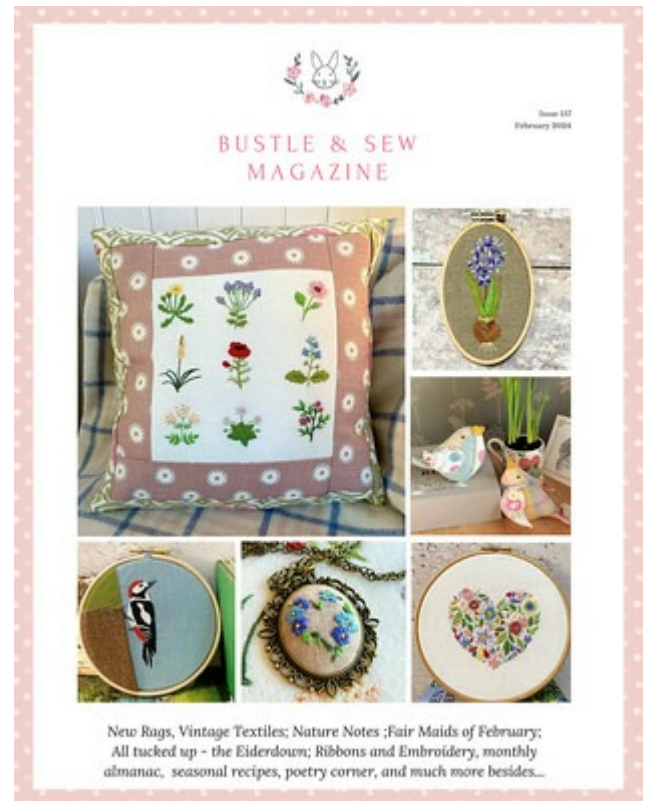
Issue 157 February 2024