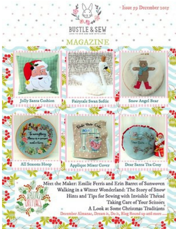
Issue 59 December 2015