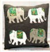
Marching Elephants Cushion