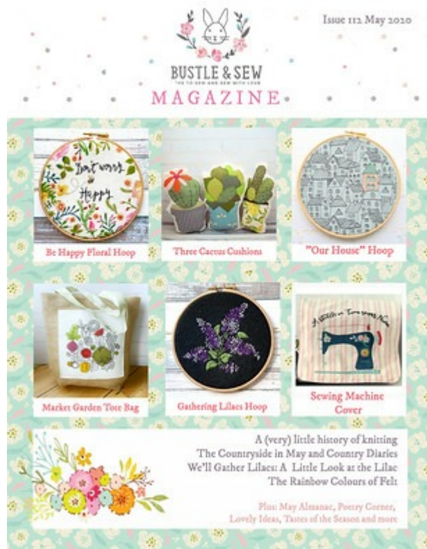
Issue 112 May 2020