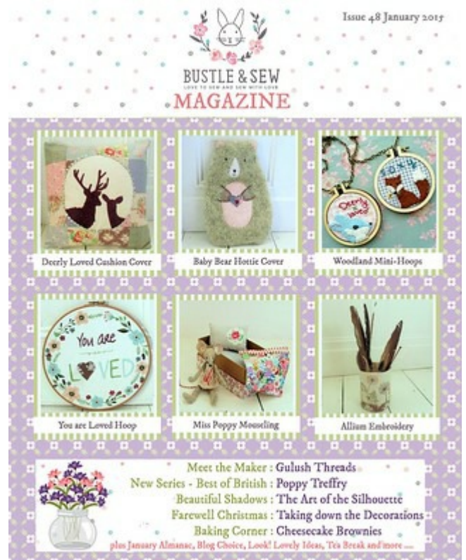
Issue 48 January 2015