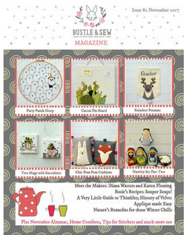
Issue 82 November 2017