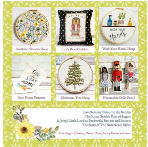
Issue 115 August 2020