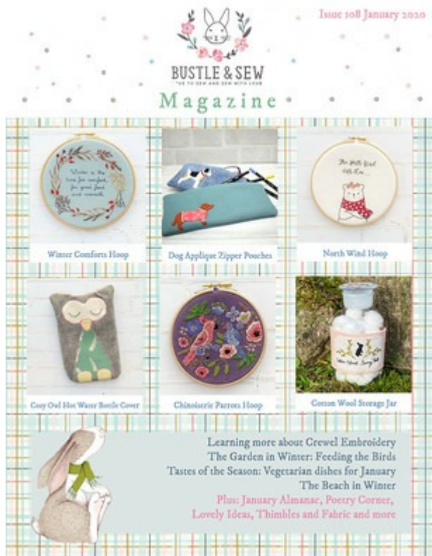
Issue 108 January 2020