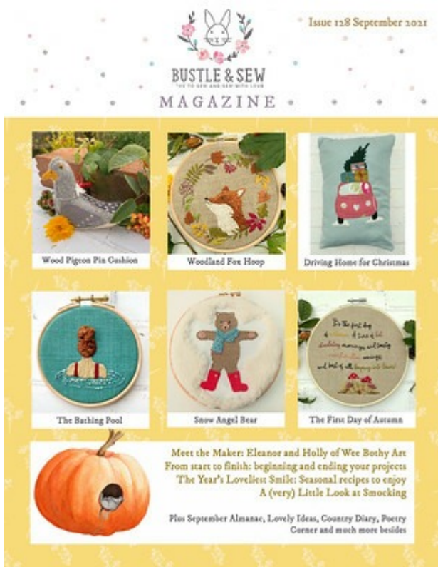
Issue 128 September 2021