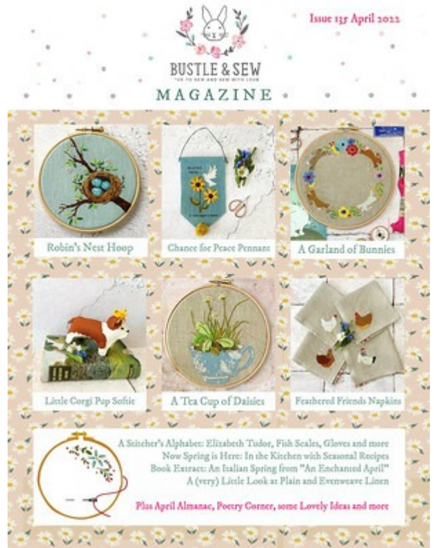
Issue 135 April 2022