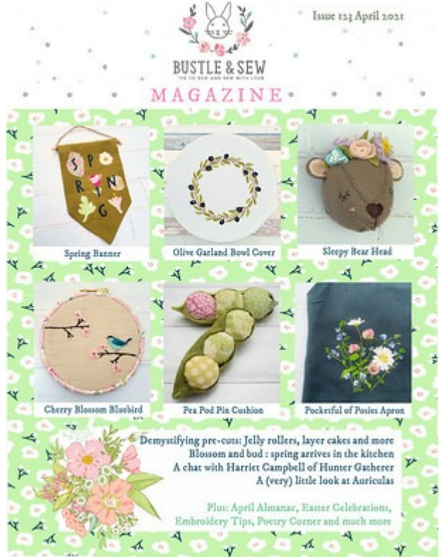
Issue 123 April 2021