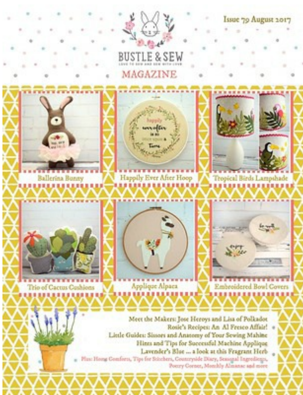
Issue 79 August 2017