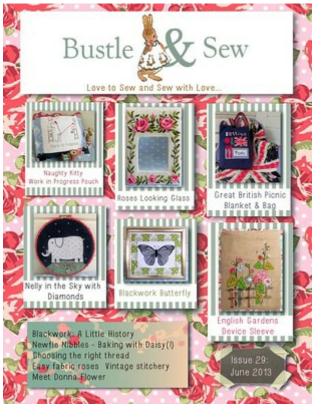
Issue 29 June 2013