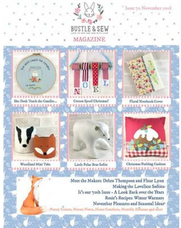
Issue 70 November 2016