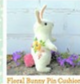
Floral Bunny Pin Cushion

BUSTLE & SEW THE TO DO AND SEE WITH LOVE MAGAZINE