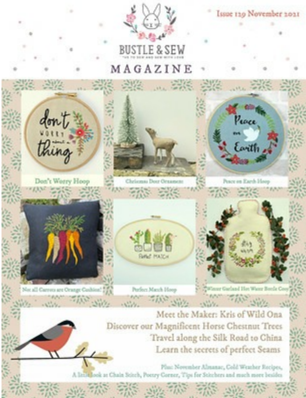
Issue 130 November 2021