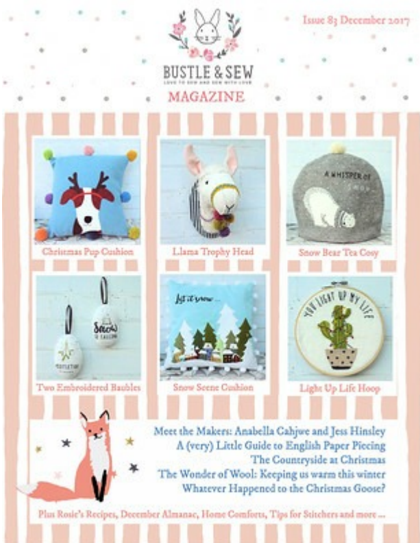
Issue 83 December 2017