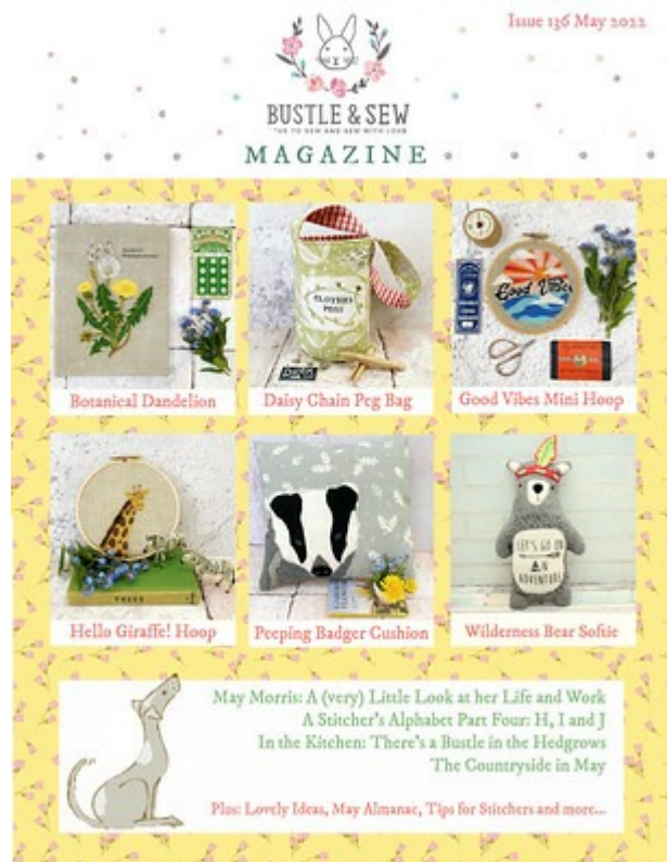
Issue 136 May 2022