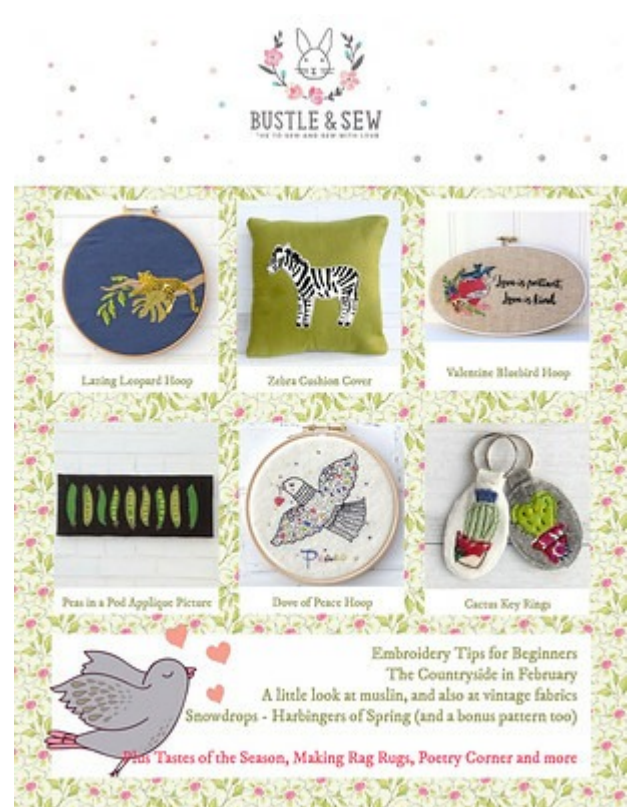
Issue 109 February 2020