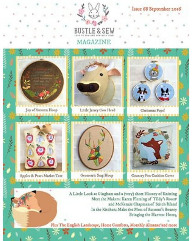
Issue 68 September 2016