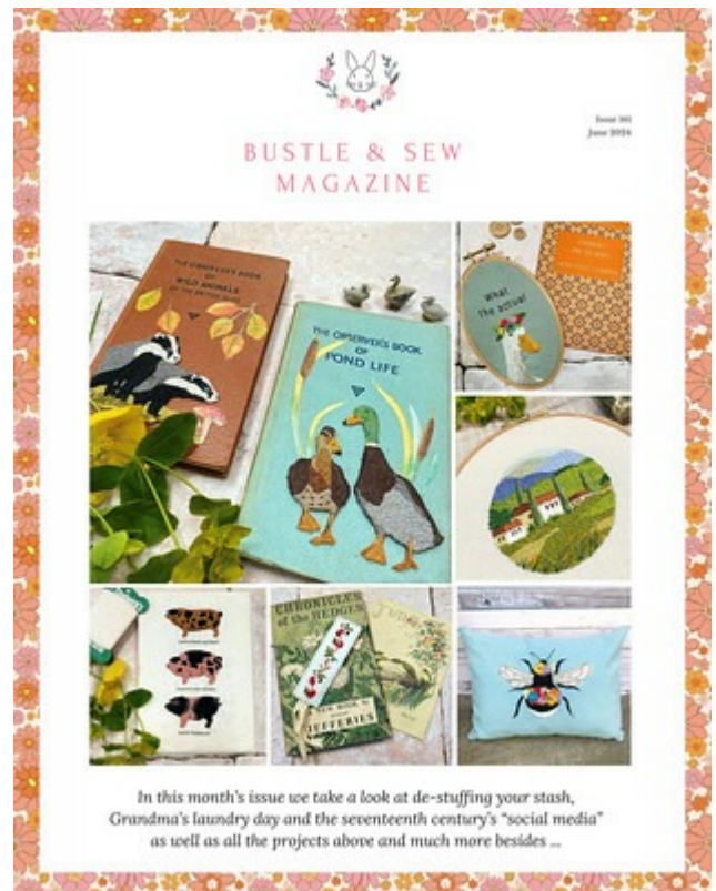
Issue 161 June 2024