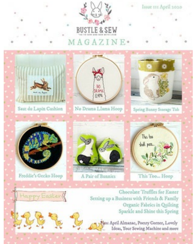
Issue 111 April 2020