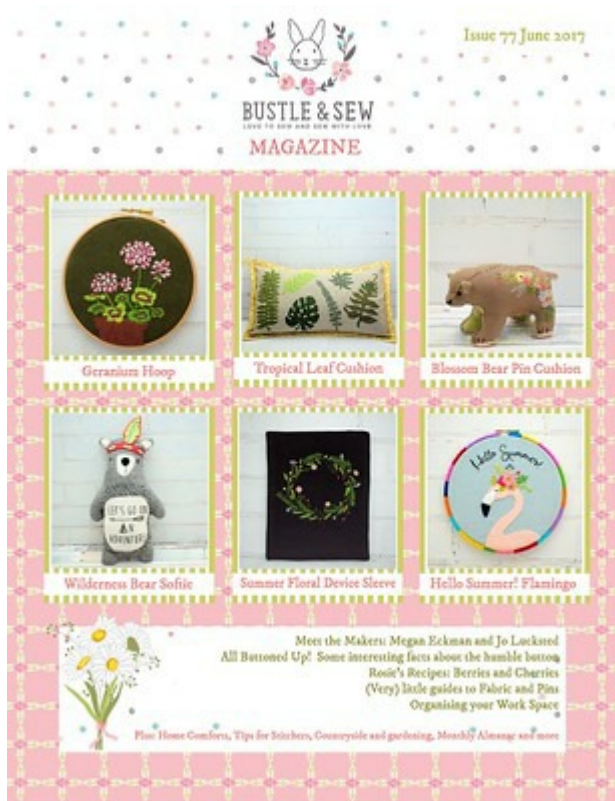
Issue 77 June 2017