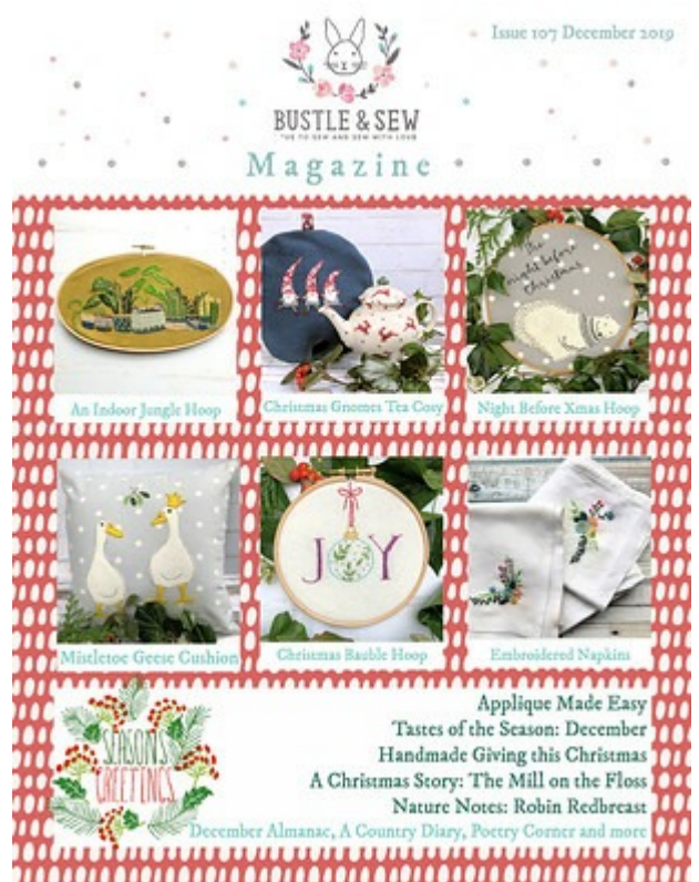
Issue 107 December 2019