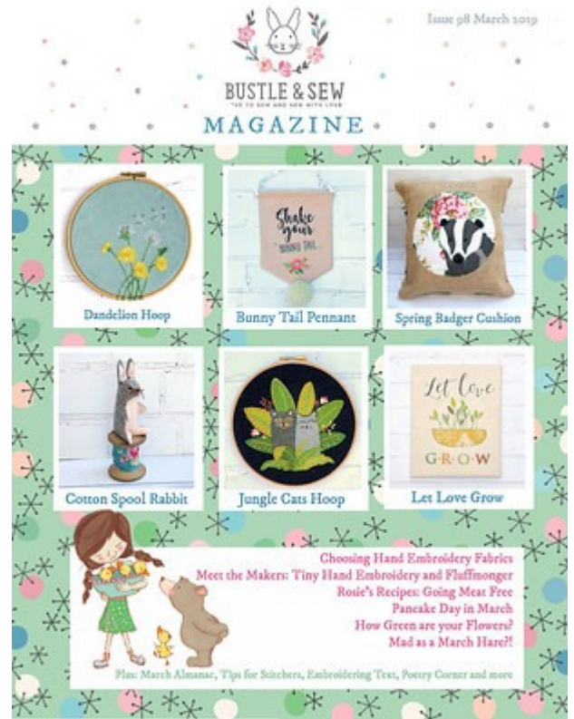
Issue 98 March 2019