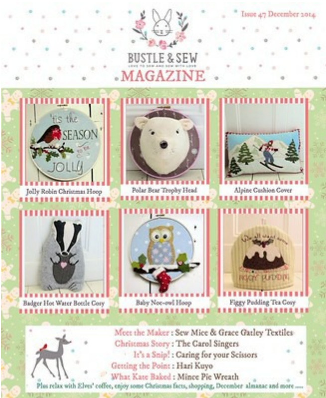
Issue 47 December 2014