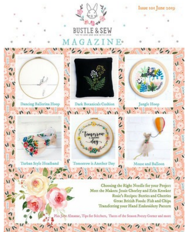
Issue 101 June 2019