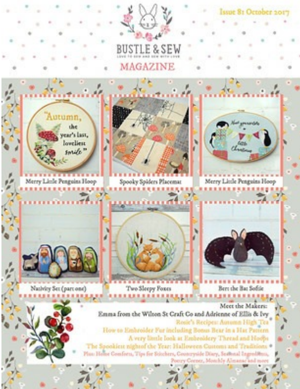
Issue 81 October 2017