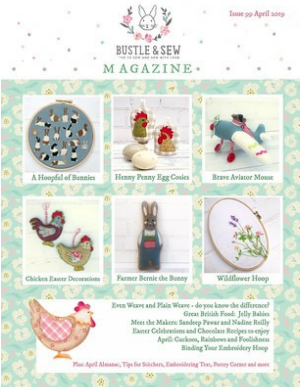
Issue 99 April 2019