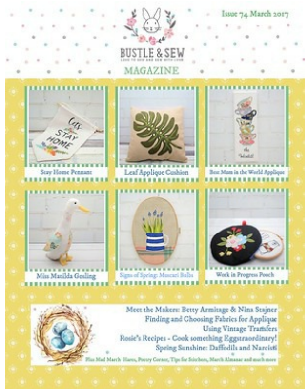
Issue 74 March 2017