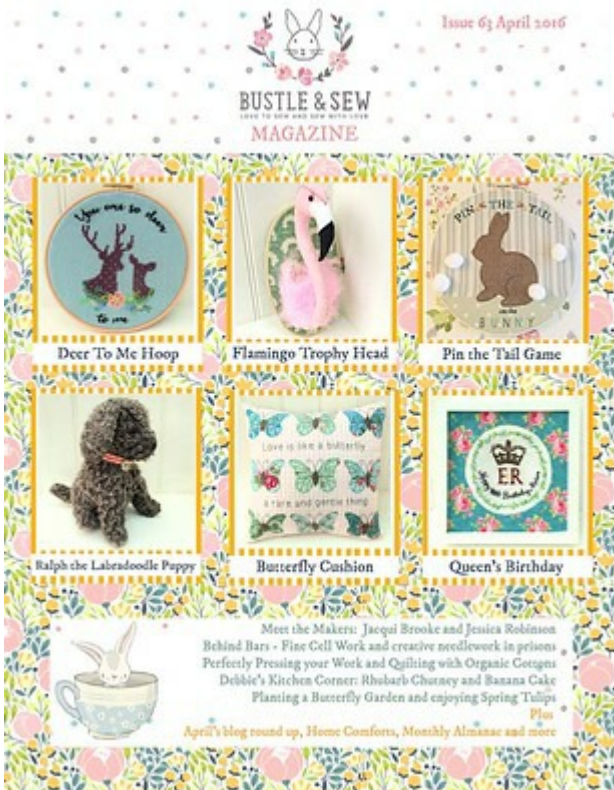
Issue 63 April 2016