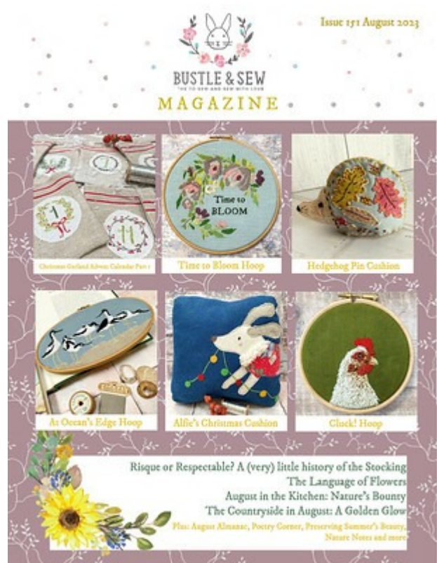
Issue 151 August 2023