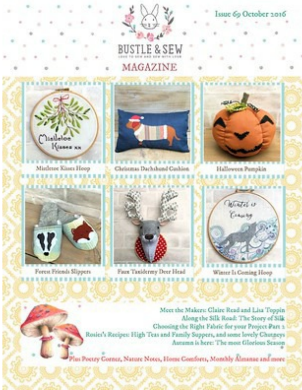
Issue 69 October 2016