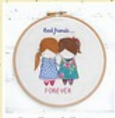
Best Friends Forever