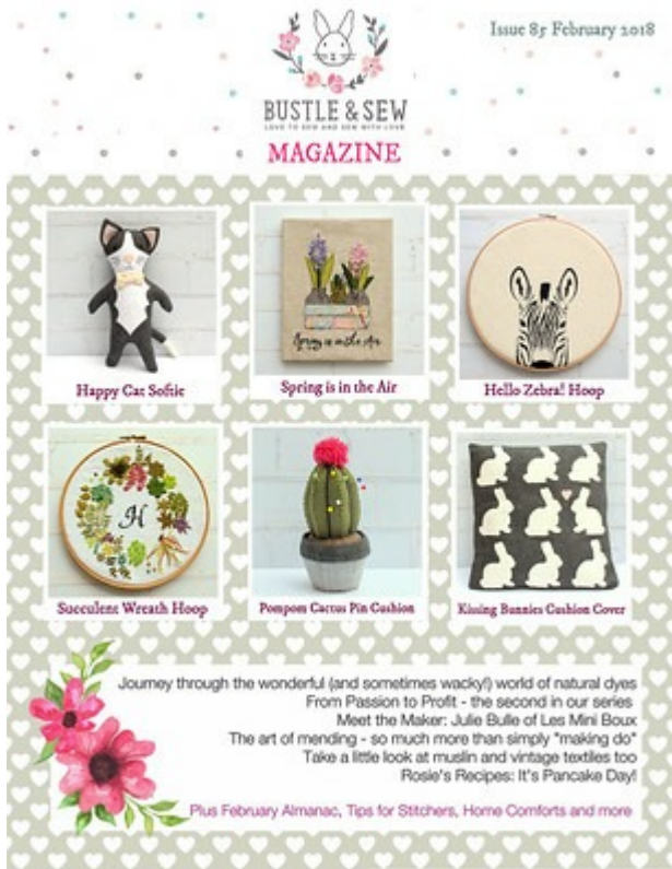
Issue 85 February 2018