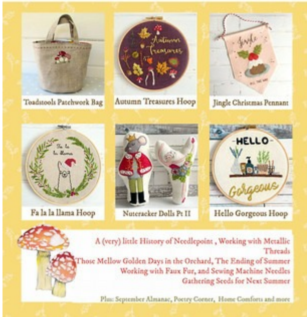
Issue 116 September 2020