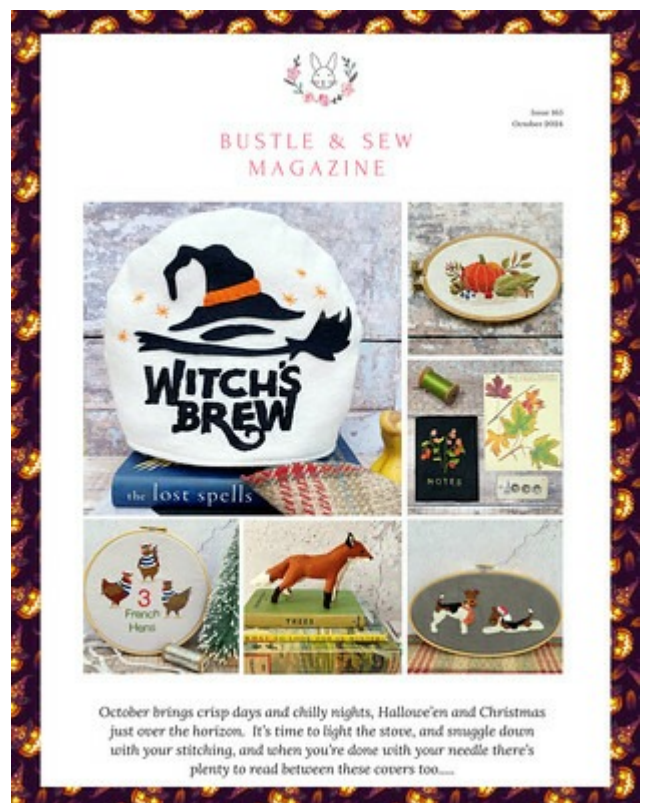
Issue 165 October 2024