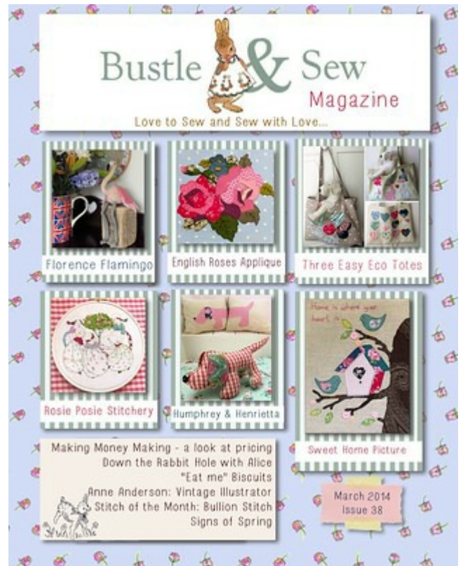
Issue 38 March 2014