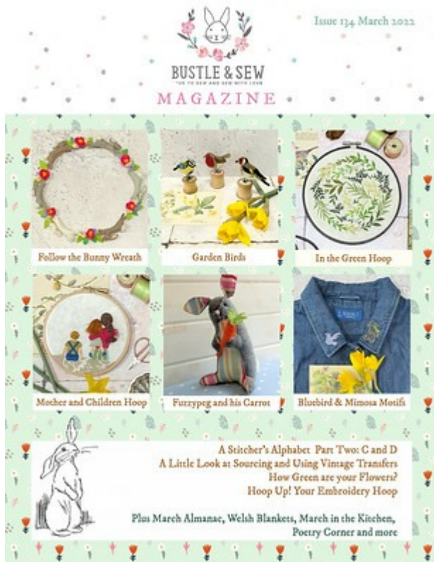
Issue 134 March 2022