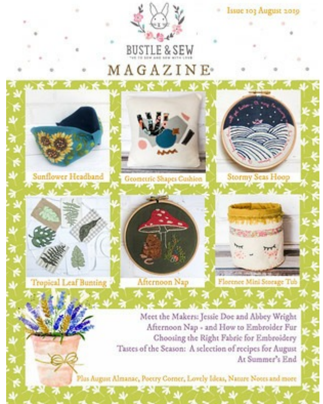
Issue 103 August 2019