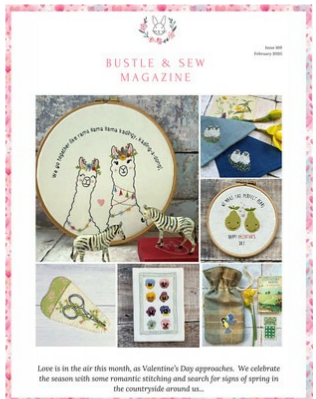
Issue 169 February 2025